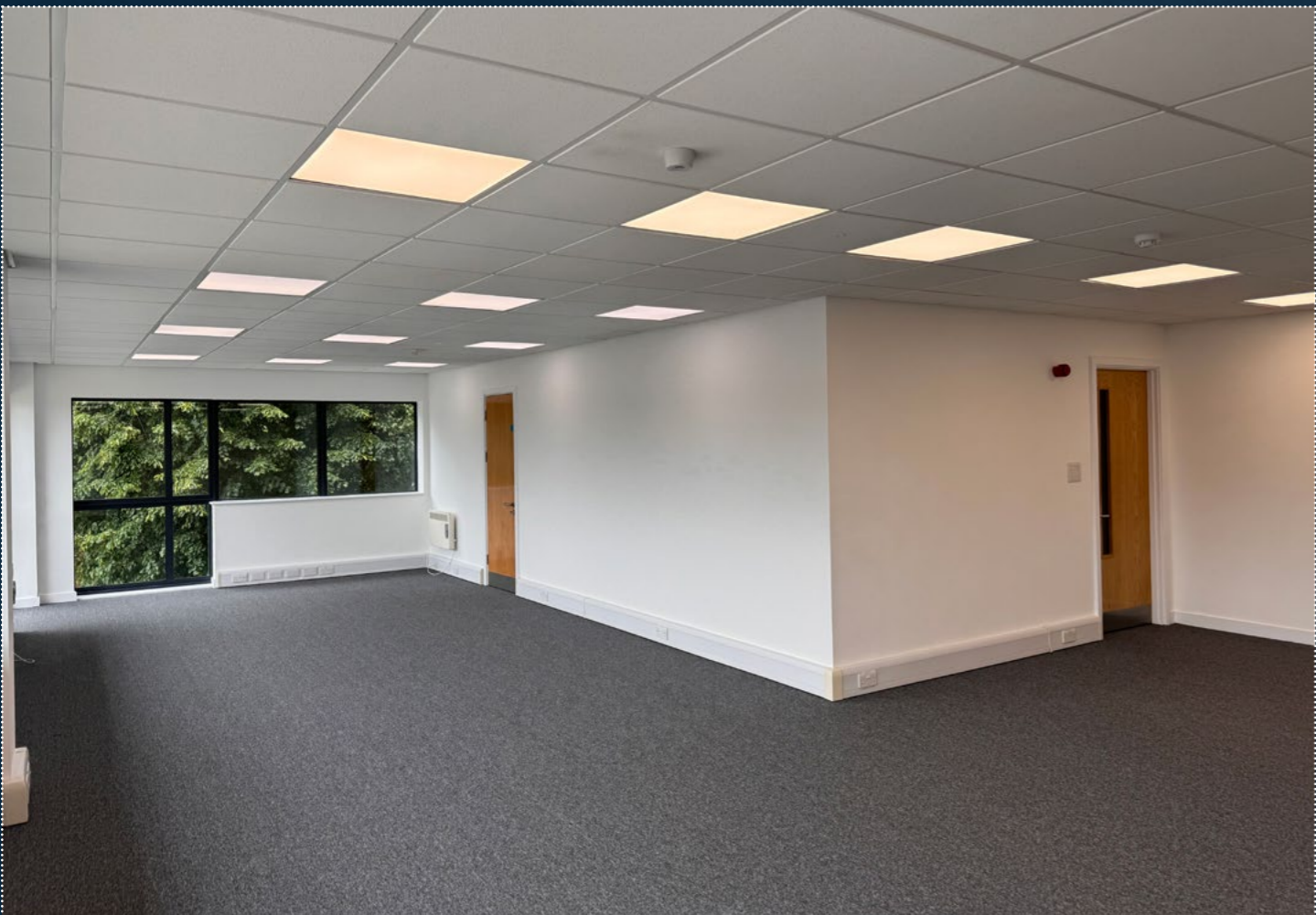
Typical first floor accommodation