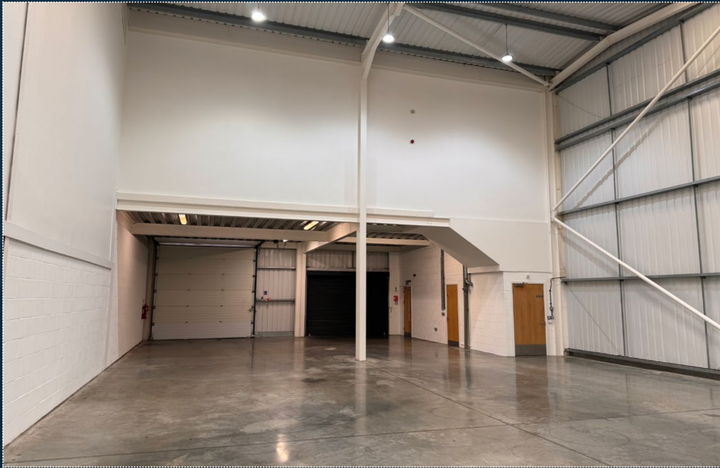
Typical ground floor accommodation