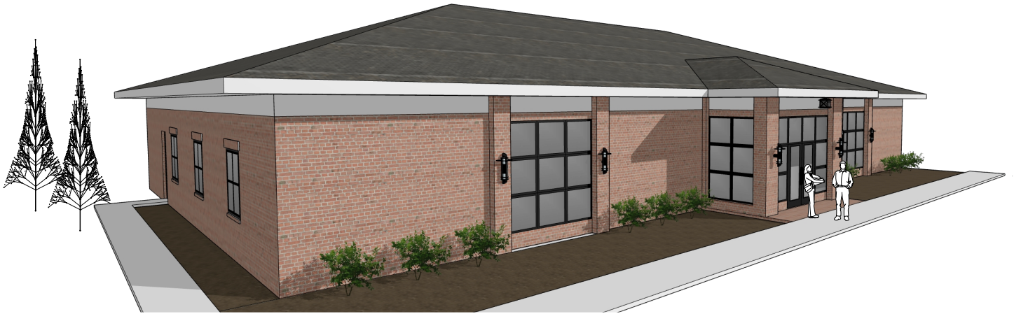
Proposed Building Design