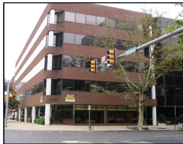
Table 14-701-3: Dimensional Standards for Commercial Districts