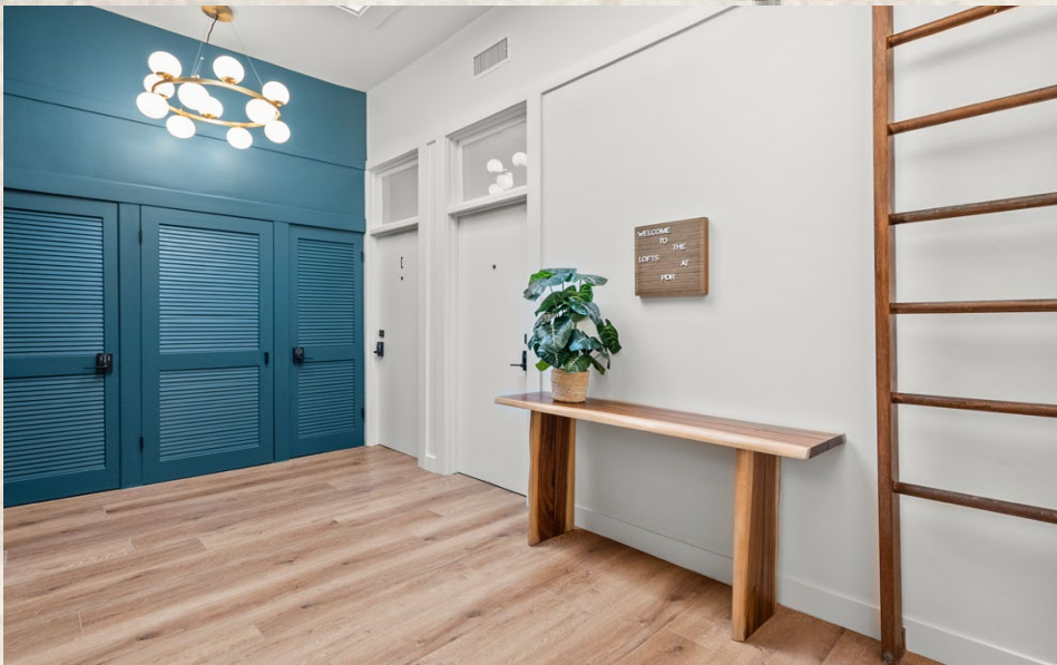
Interior Photos - 2nd Floor - Unit A , B & C