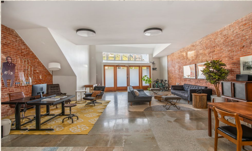
Interior Photos - 1st Floor