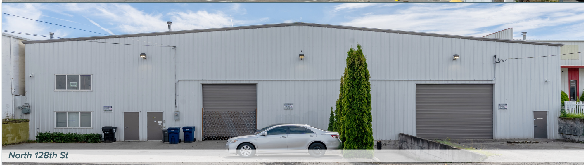
North 128th St