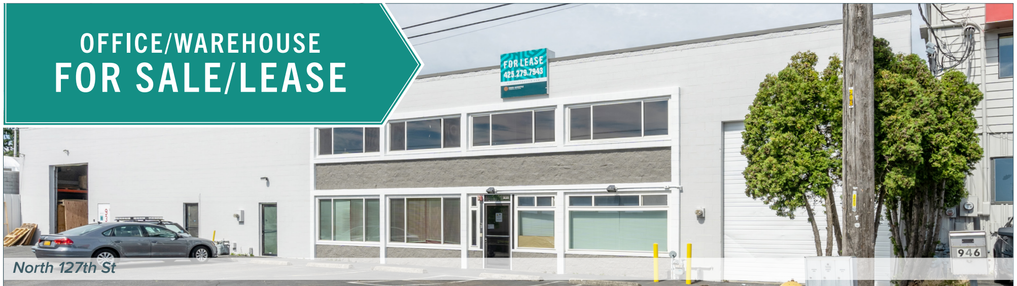
North 127th St