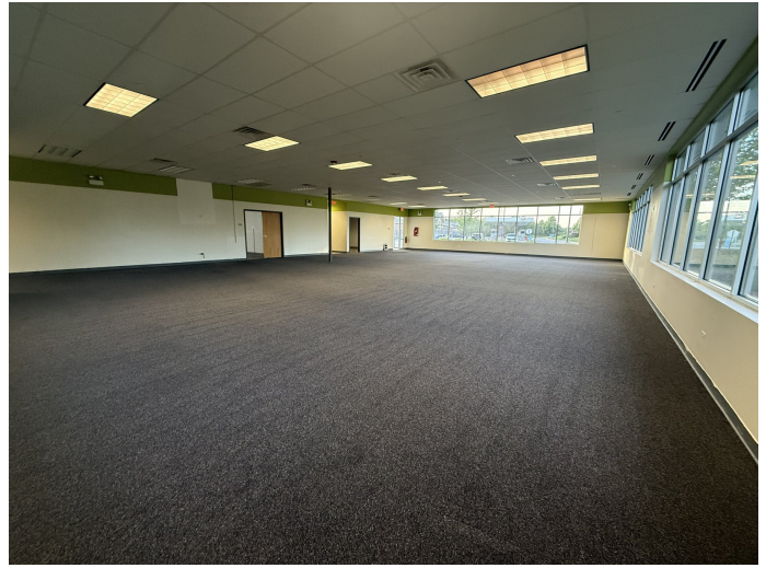
Showroom — natural light, high ceilings, neutral finishes.