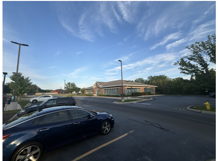
Interior entry looking out to Milwaukee Avenue.