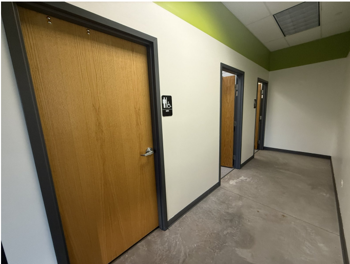
Restroom corridor — two restrooms (Men / Women) + janitorial.