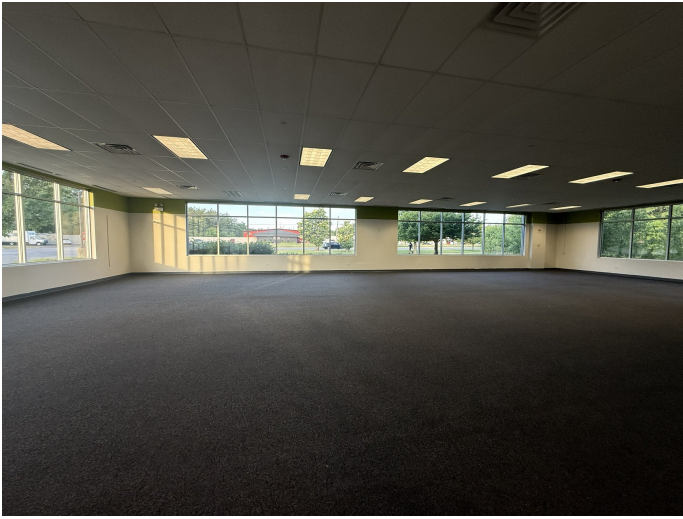
Open showroom with expansive display-window frontage.