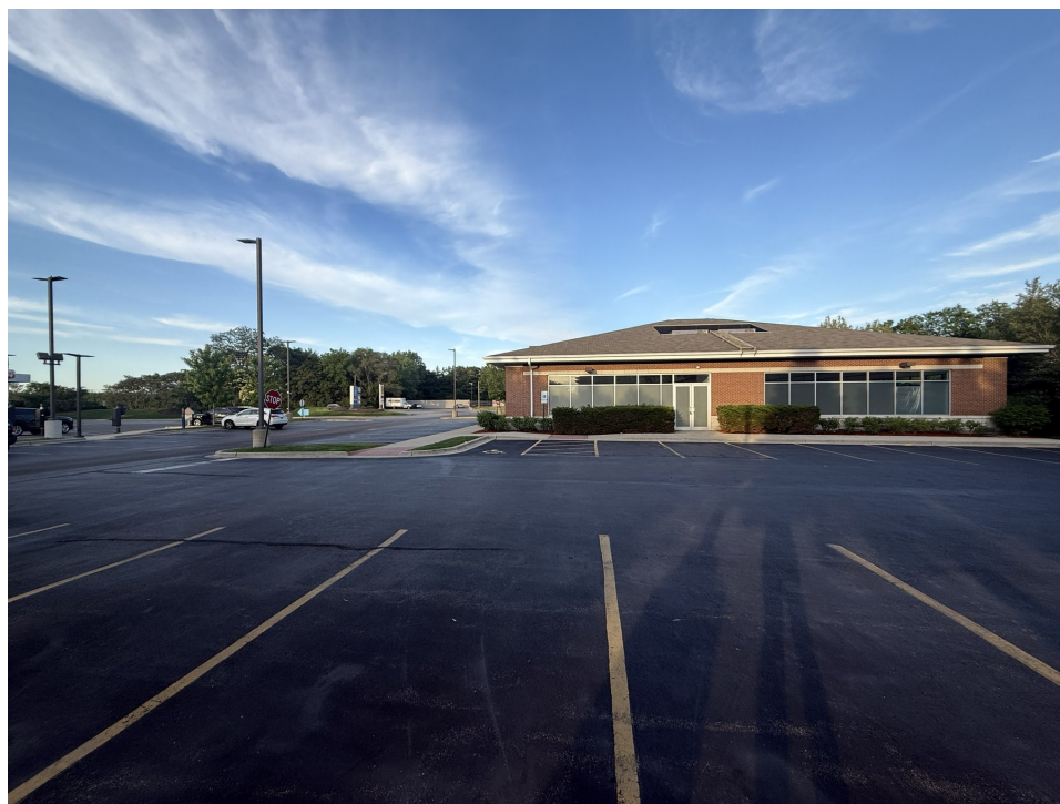
Corner exposure and parking field along Milwaukee Avenue.

Sources: U.S. Census Bureau / ACS; village & radius demographic estimates. Figures approximate.