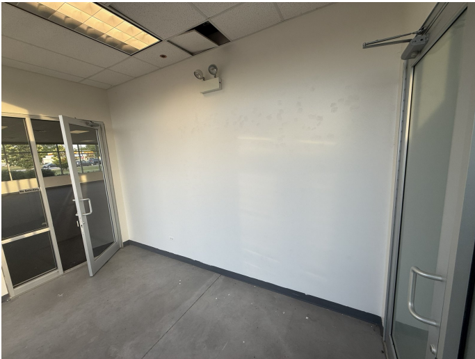
Entry vestibule / foyer with double-door glass entrance.