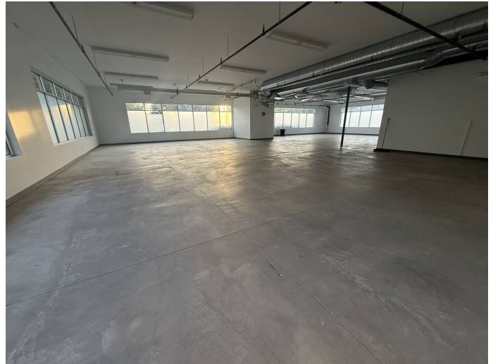
Flex space with exposed mechanicals and abundant glazing.