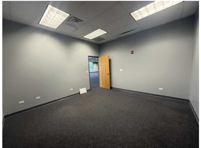
Private office with secondary entry to adjoining space.