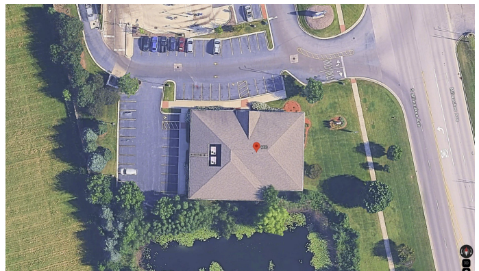
Left: front elevation & entry. Right: aerial — corner position on Milwaukee Avenue.