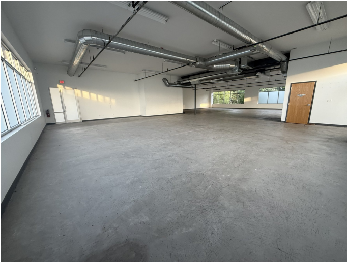
Warehouse / flex area — high ceilings, sealed concrete floor.