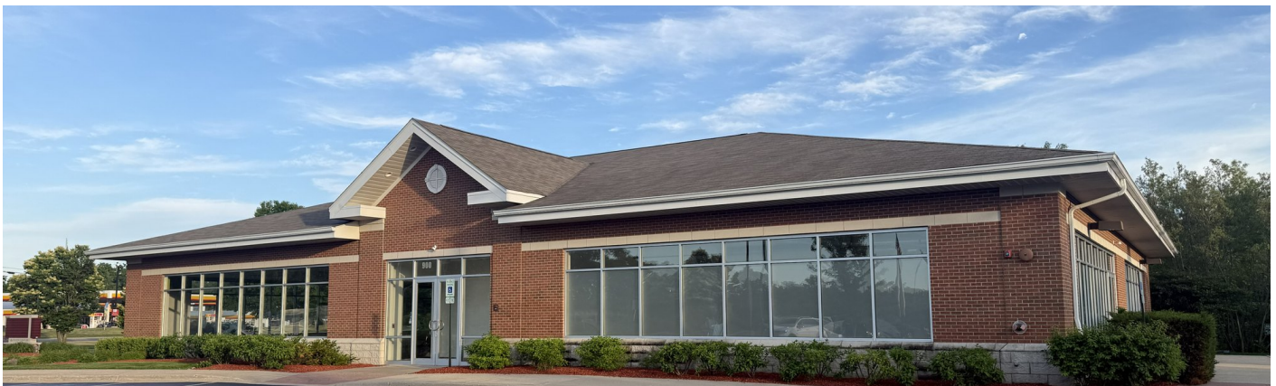
Exterior — Milwaukee Avenue frontage and entry.