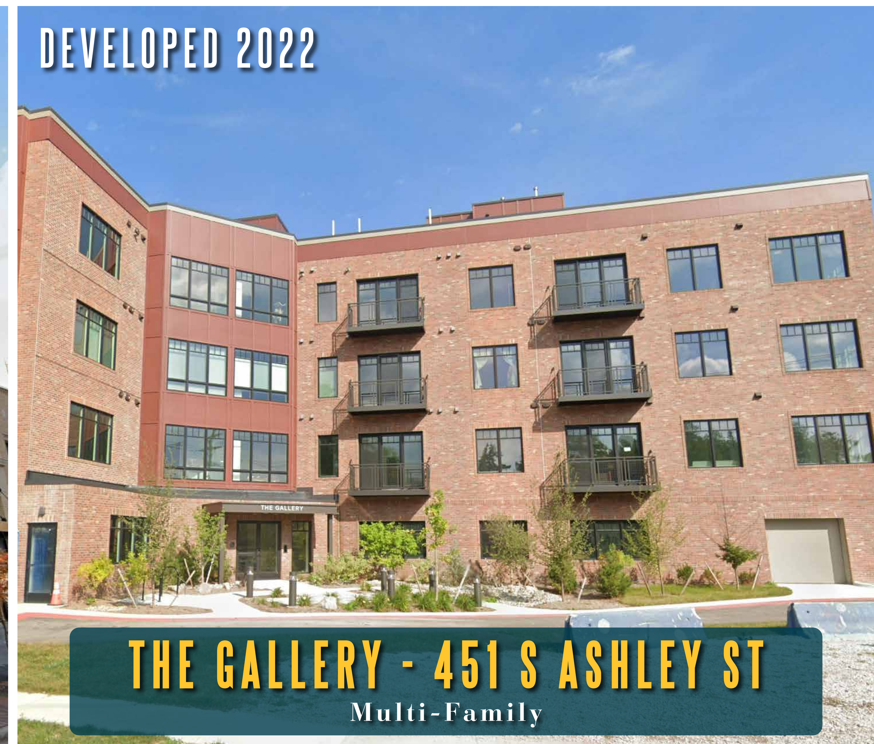
THE GALLERY - 451 S ASHLEY ST Multi-Family