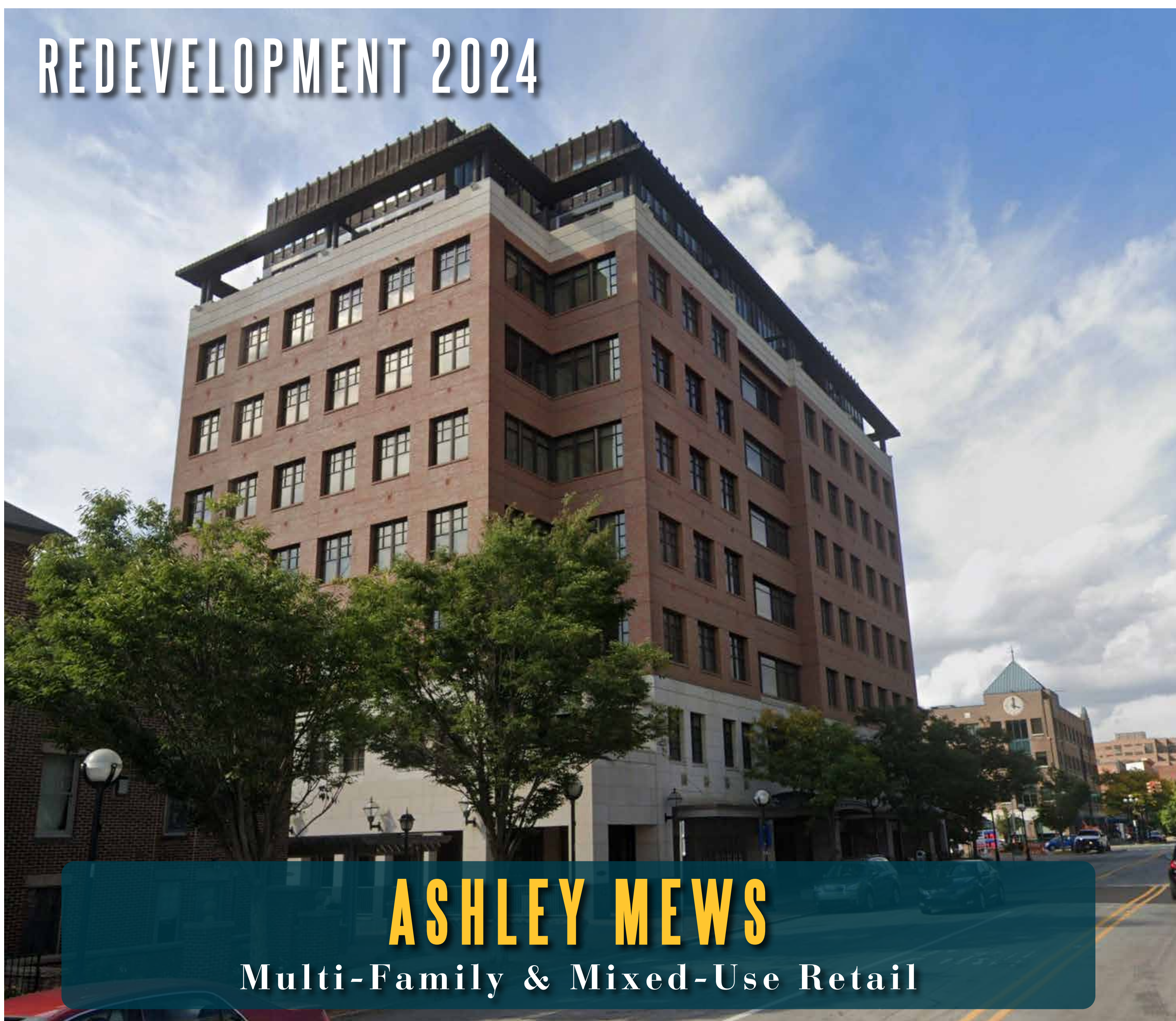
ASHLEY MEWS Multi-Family & Mixed-Use Retail