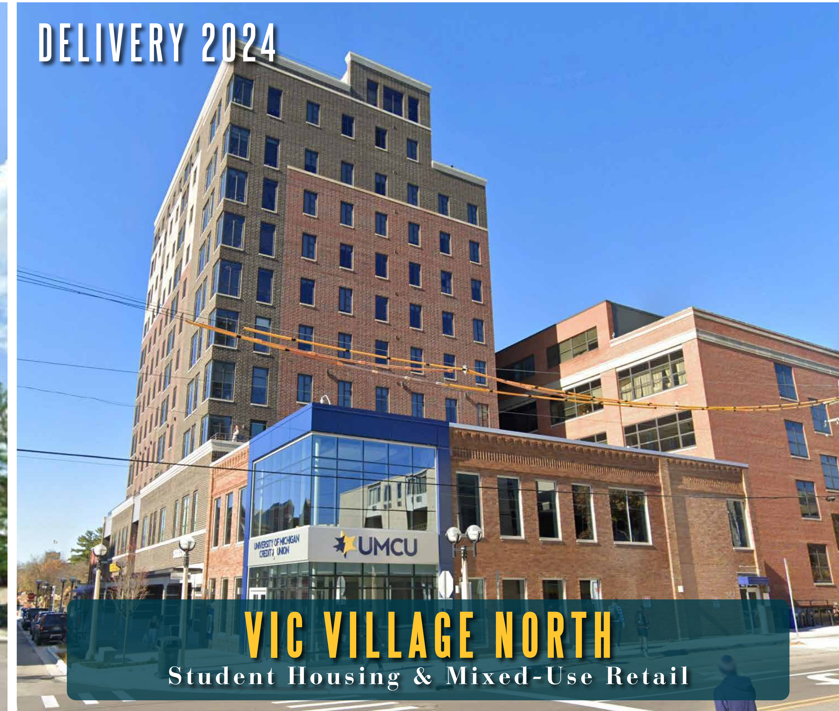
VIC VILLAGE NORTH Student Housing & Mixed-Use Retail