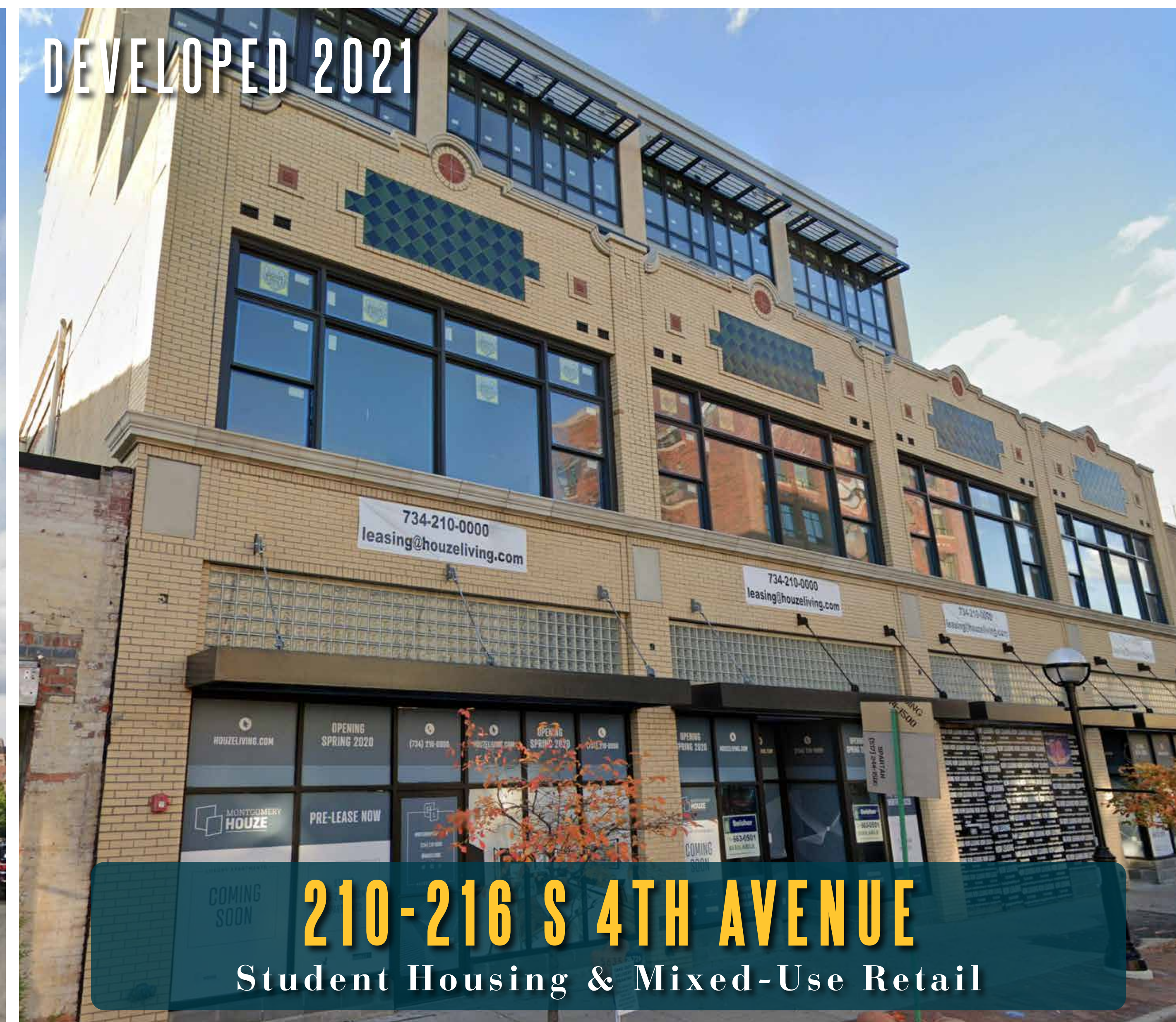
210-216 S 4TH AVENUE Student Housing & Mixed-Use Retail