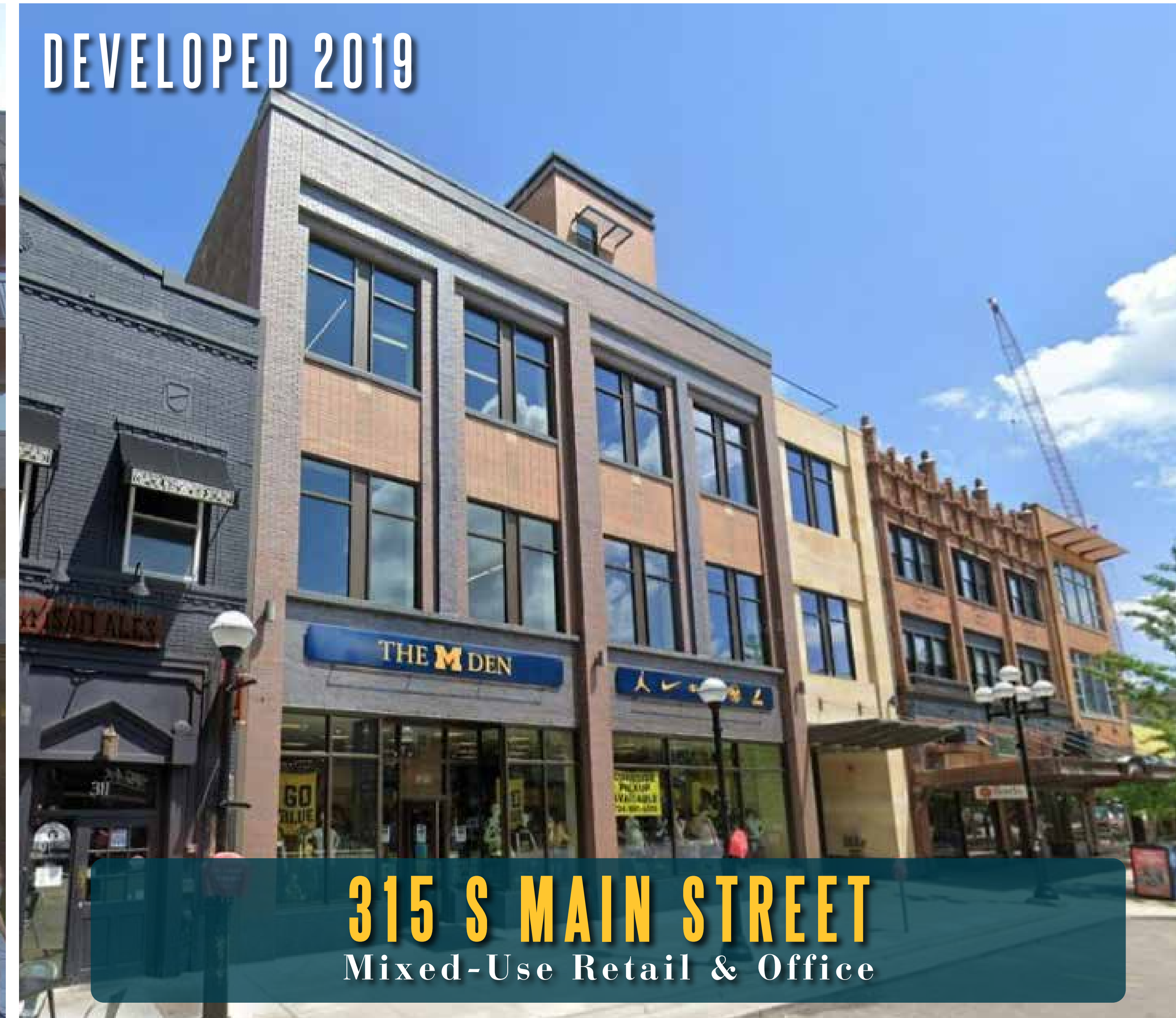
315 S MAIN STREET Mixed-Use Retail & Office