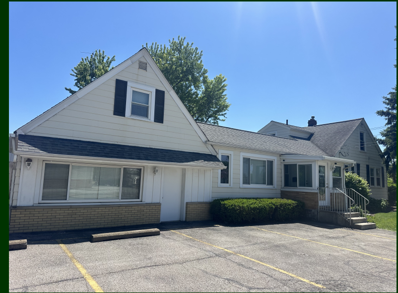
36403 Vine St., Willoughby, OH 44094

No warranty or representation, express or implied, is made as to the accuracy of the information contained herein. It is submitted subject to errors, omissions, price changes, rental or other conditions, withdrawal without notice, and to any special listing conditions imposed by our client.