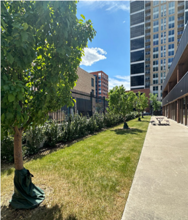
Private Outdoor Space