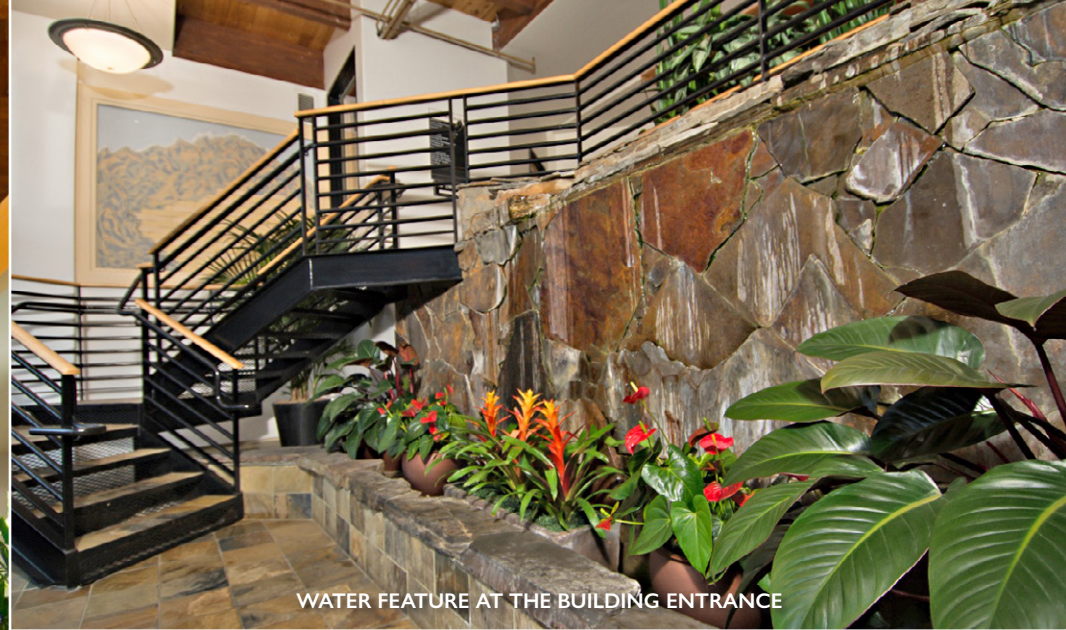
WATER FEATURE AT THE BUILDING ENTRANCE