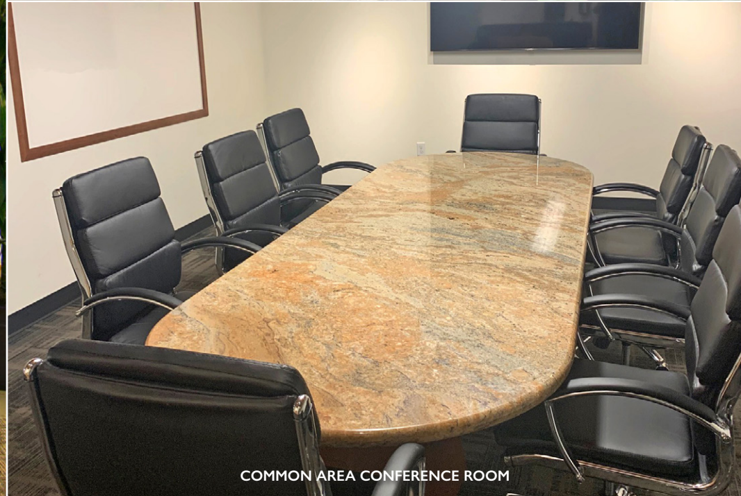
COMMON AREA CONFERENCE ROOM