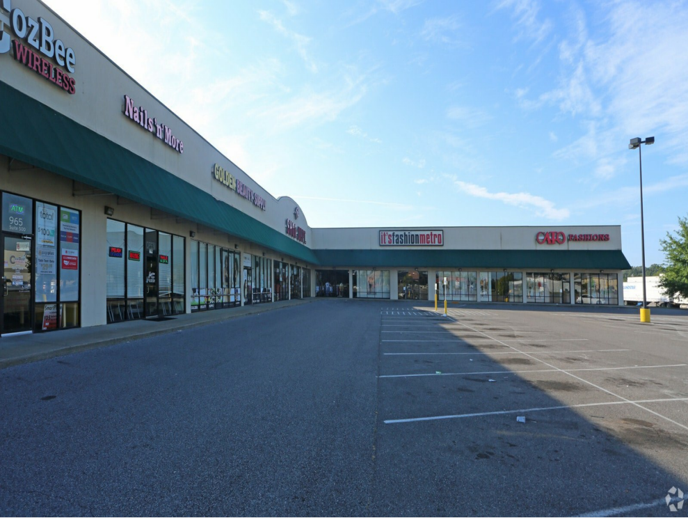
965 Highway 80 W - River Bend Shopping Center