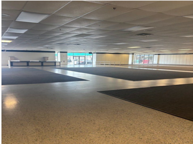
Interior Pic 2