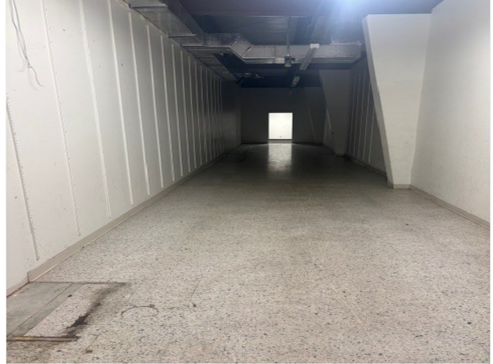
Interior Pic 6