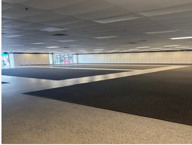
Interior Pic 1