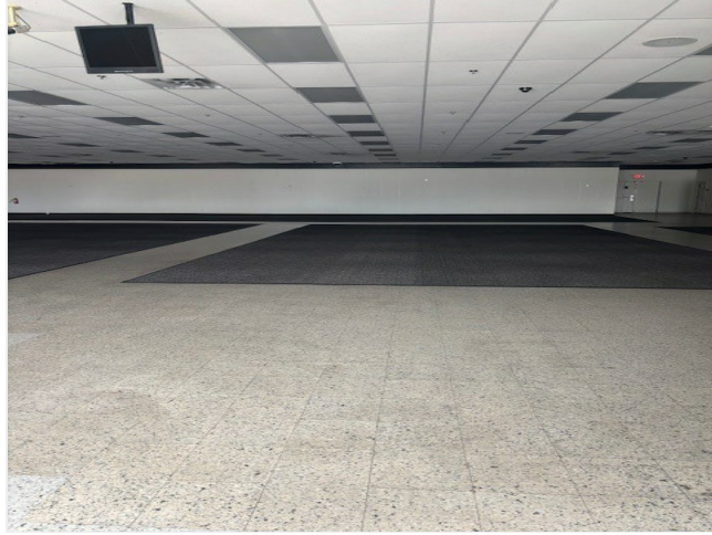
Interior Pic 3