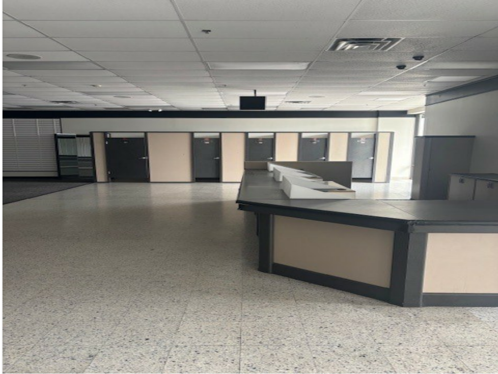
Interior Pic 5