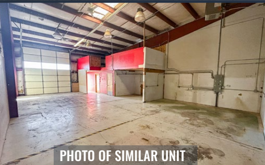
PHOTO OF SIMILAR UNIT