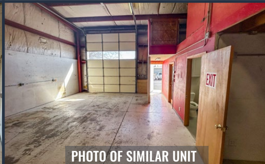
PHOTO OF SIMILAR UNIT