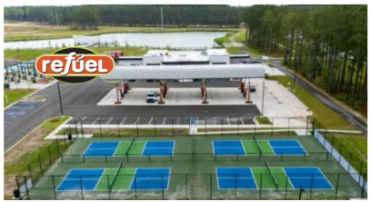
Avian Commons, Camps Hall's amenity center, features recreation fields and courts, outdoor dining, Refuel gas station, fitness center, and (coming soon) childcare center.