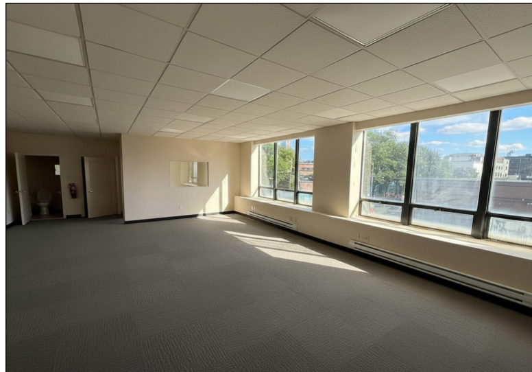
9-17 43 RD AVENUE - SECOND FLOOR OFFICE

Any information set-forth herein has been obtained from sources deemed reliable, however, we have not verified it, and make no representation or warranty of any kind, including without limitation; condition: either latent or patent, size or manner of construction of the property, compliance with local law, and environmental conditions. All information submitted herein is subject to errors and omissions, and the right of our principal(s), to withdraw, modify, or condition the listing with-out prior notice. Broker cooperation encouraged.