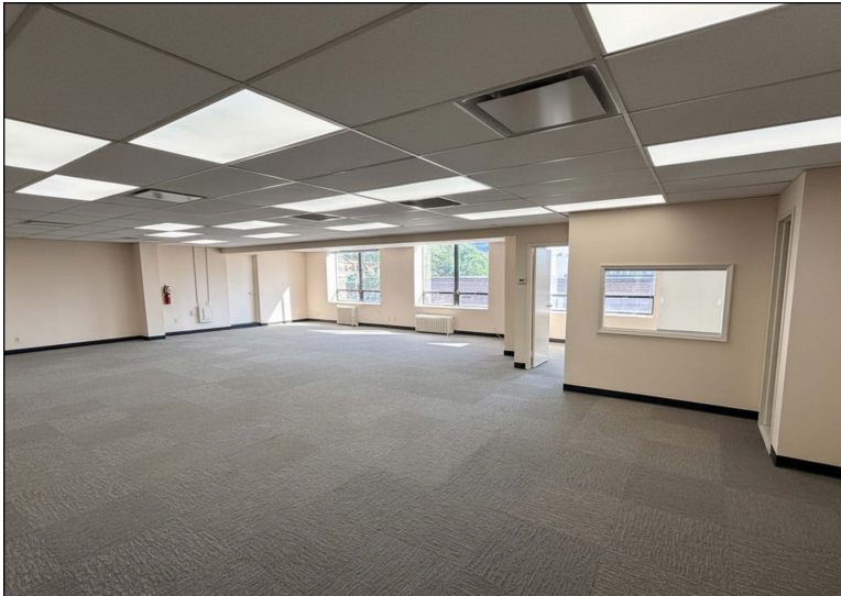
9-11 43 RD AVENUE - SECOND FLOOR OFFICE