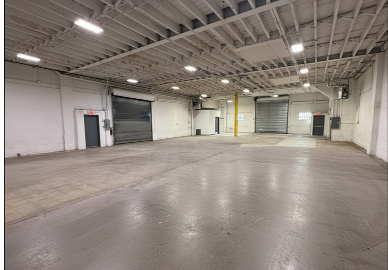
9-17 43 RD AVENUE - GROUND FLOOR WAREHOUSE