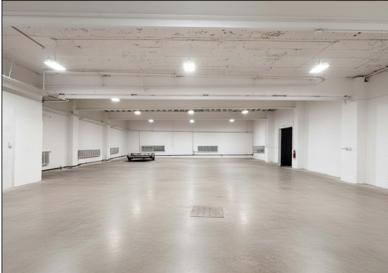
9-11 43 RD AVENUE - GROUND FLOOR WAREHOUSE