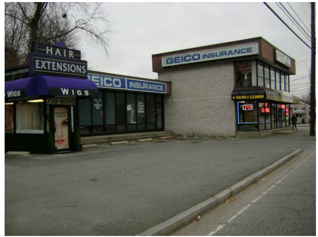
( https://images.vgsi.com/photos/WarwickRIPhotos//00\07\65\27.JPG )