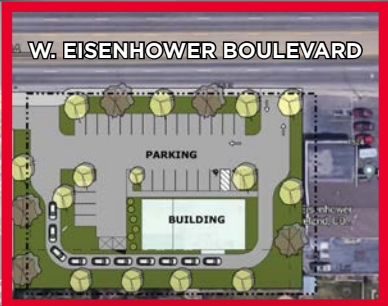
CONCEPTUAL *SUBJECT TO USERS SITE PLAN