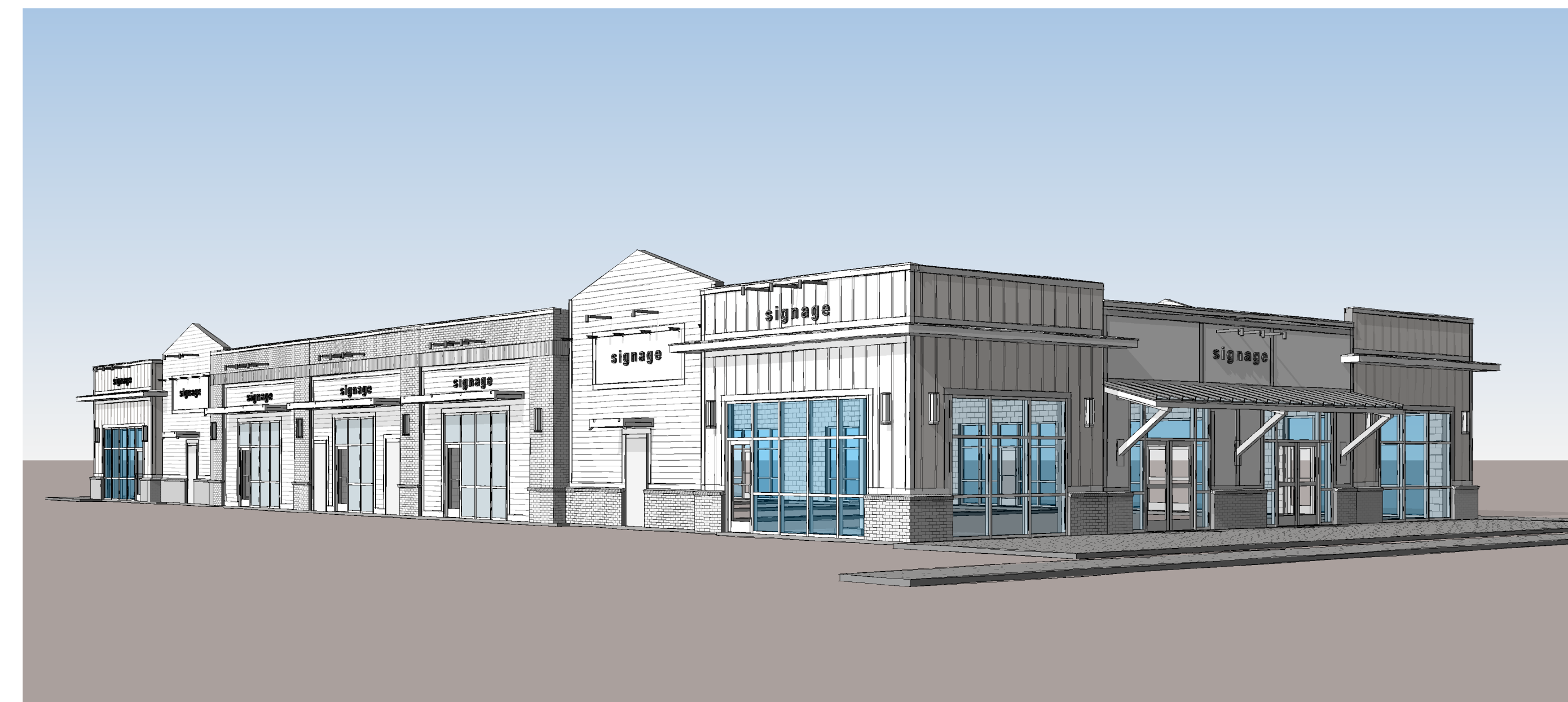
3 BLDG A - VIEW FROM 52