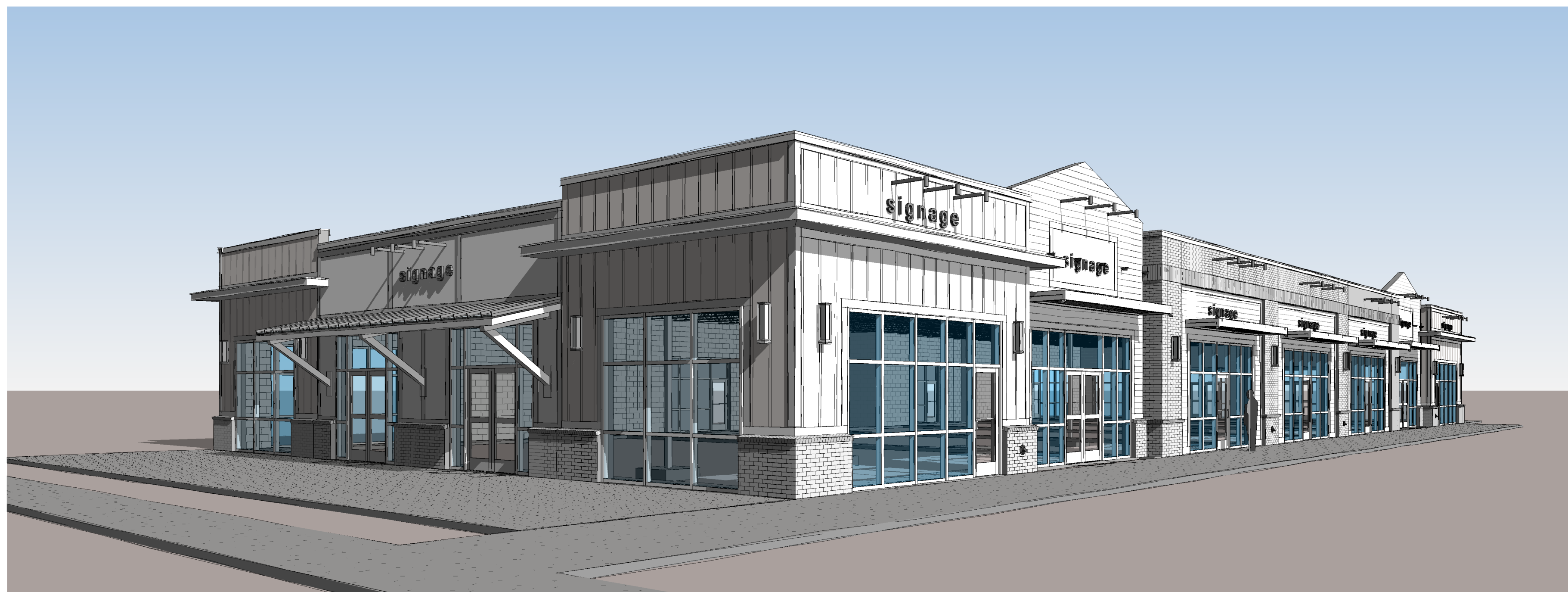
4 BLDG A - VIEW FROM PARKING