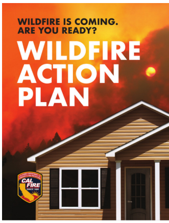
CLICK HERE TO VIEW DOCUMENT