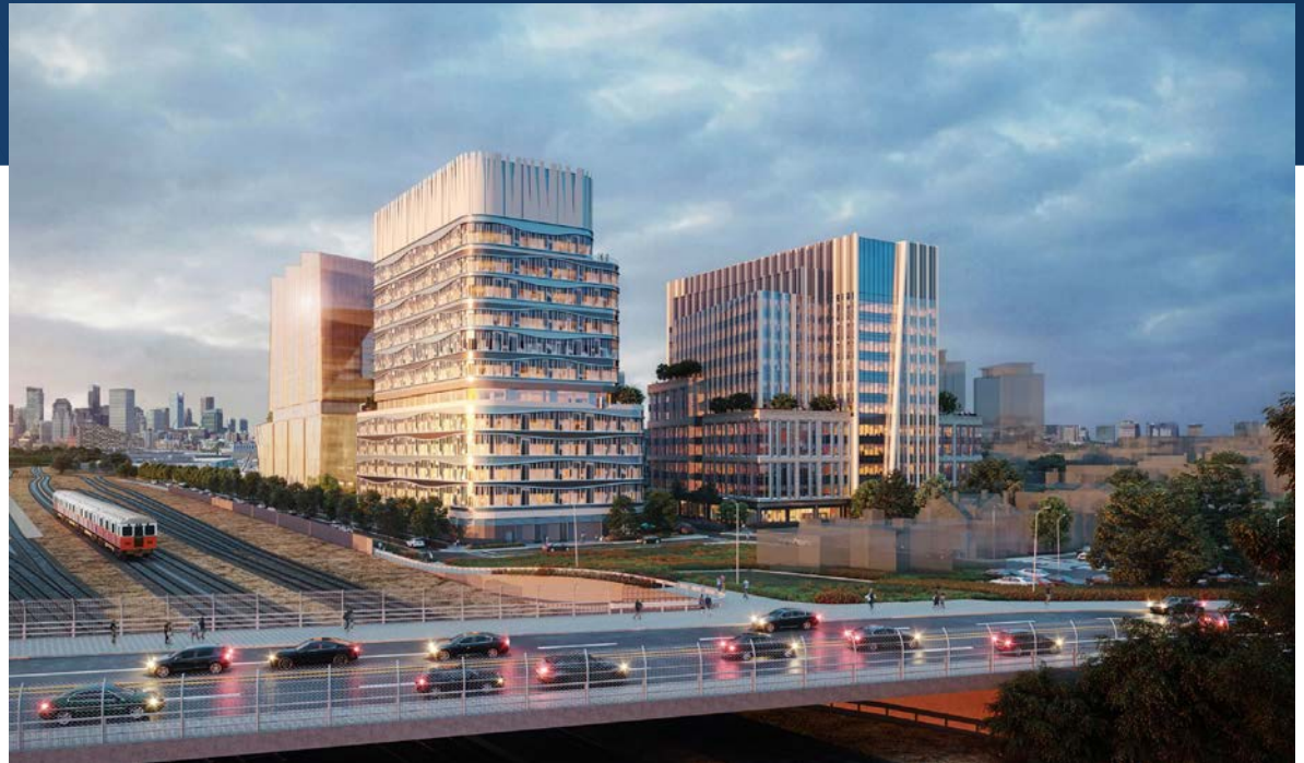
Rendering of On the Dot Project

These developments are transforming South Boston into a key hub for innovation and business, attracting top-tier companies and boosting local employment opportunities.