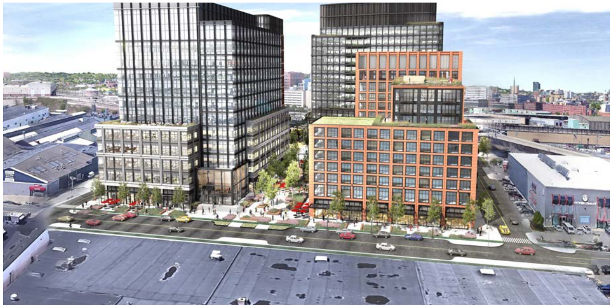
Rendering of 325 Dorchester Avenue Project