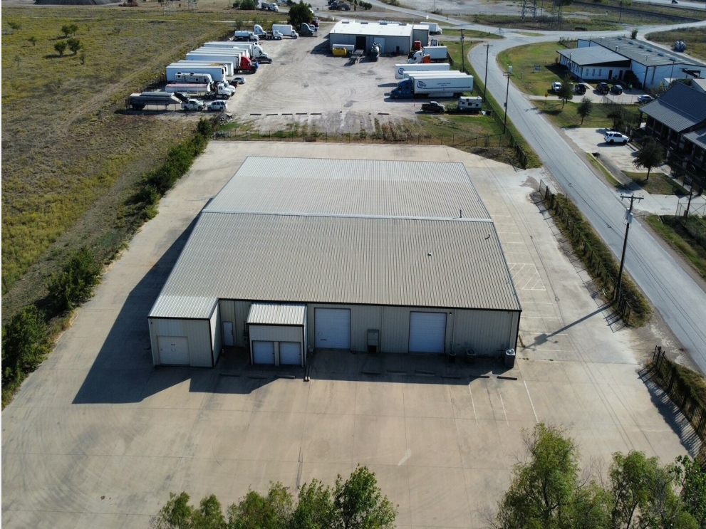
Aerial picture 7