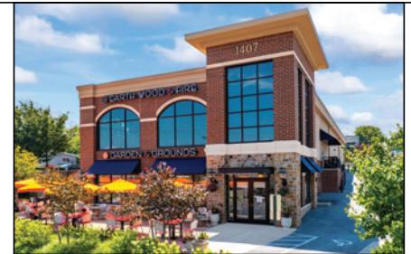
1407 Clarkview Road