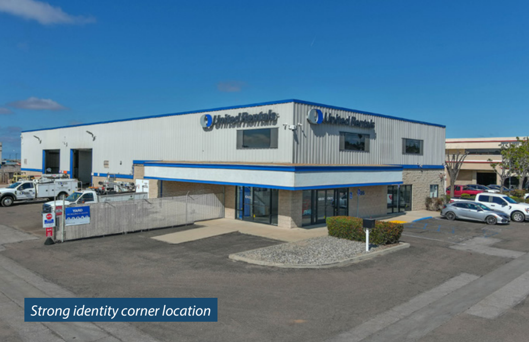
Strong identity corner location