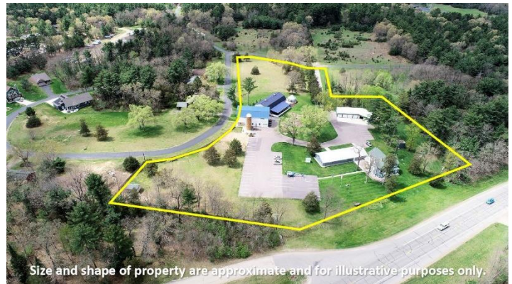
Size and shape of property are approximate and for illustrative purposes only.