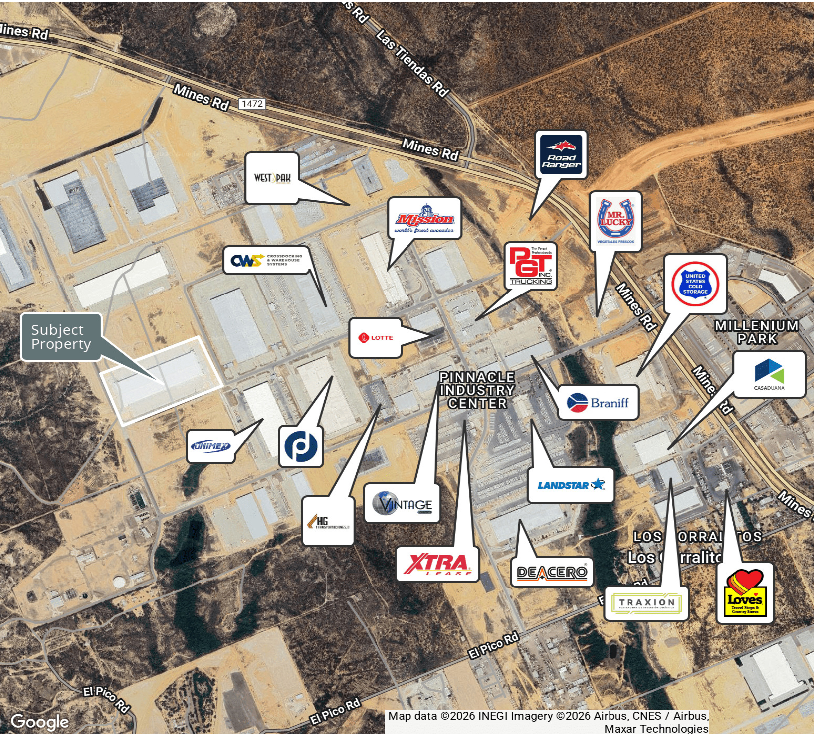
Map data ©2026 INEGI Imagery ©2026 Airbus, CNES / Airbus, Maxar Technologies

CARLO MOLANO, SIOR carlom@forumcre.com M: 956.523.9403 O: 956.717.9090