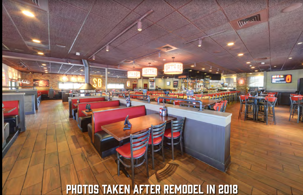
PHOTOS TAKEN AFTER REMODEL IN 2018 CONTACT BROKERS FOR VIRTUAL TOUR LINK