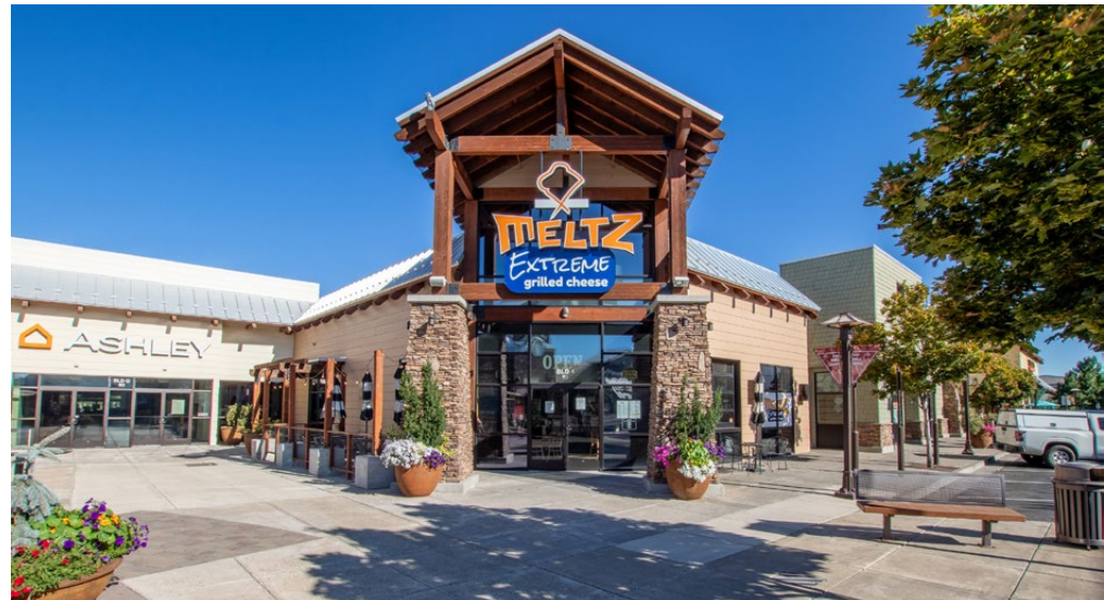
Corner Location Fronting Village Plaza