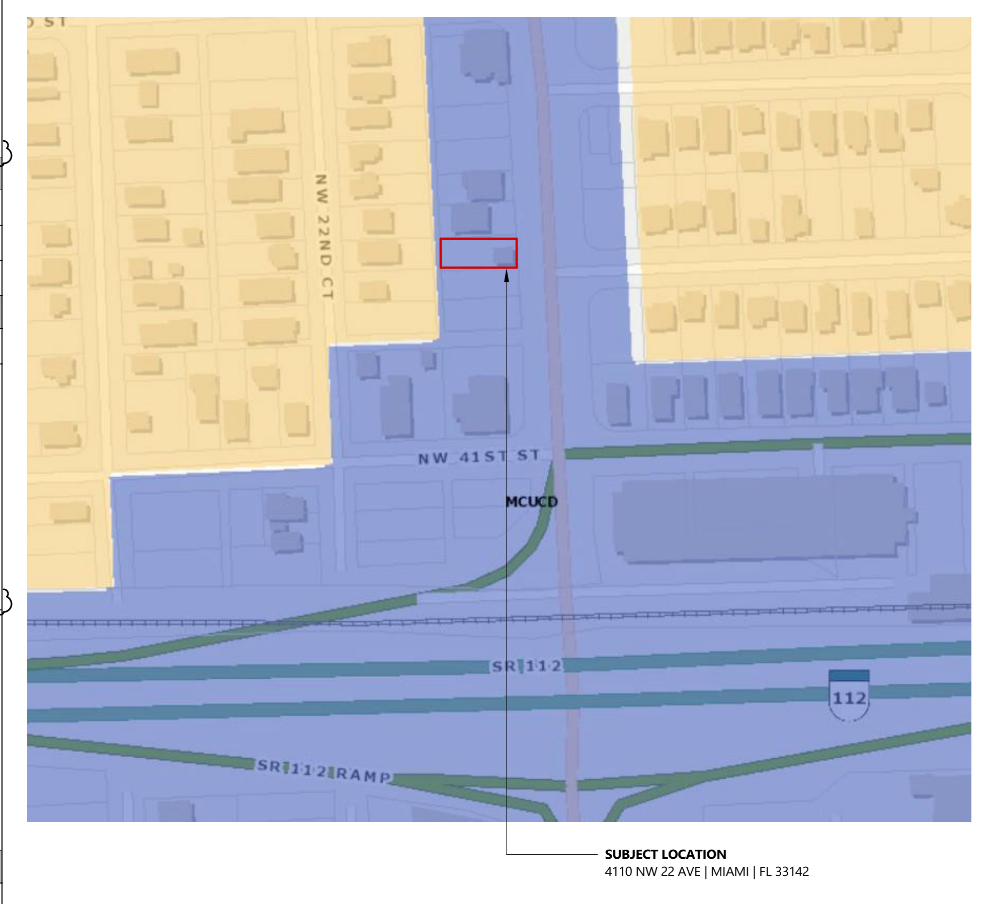
4 ZONING MAP N.T.S.