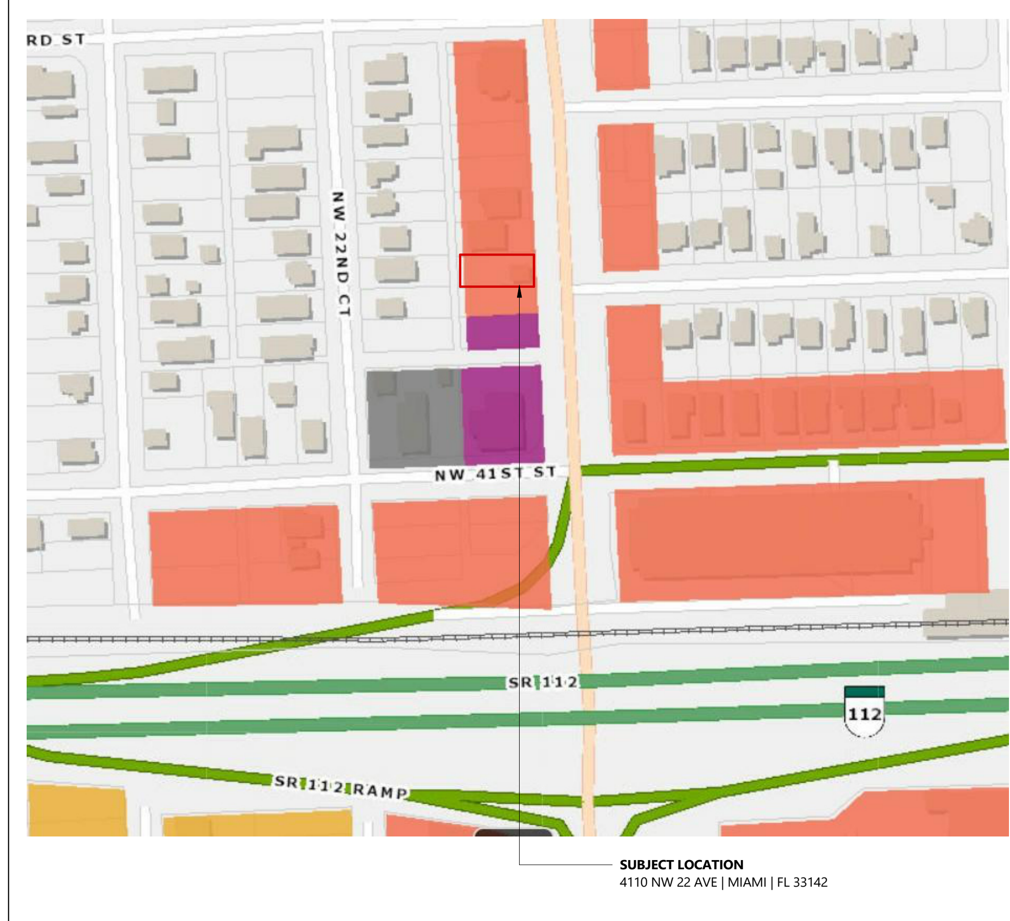
3 URBAN CENTER N.T.S.

PROJECT AND OWNER: SUNSHINE RESIDENCE 4110 NW 22 AVE MIAMI | FL | 33142 FLORIDA SUNSHINE 9 LLC