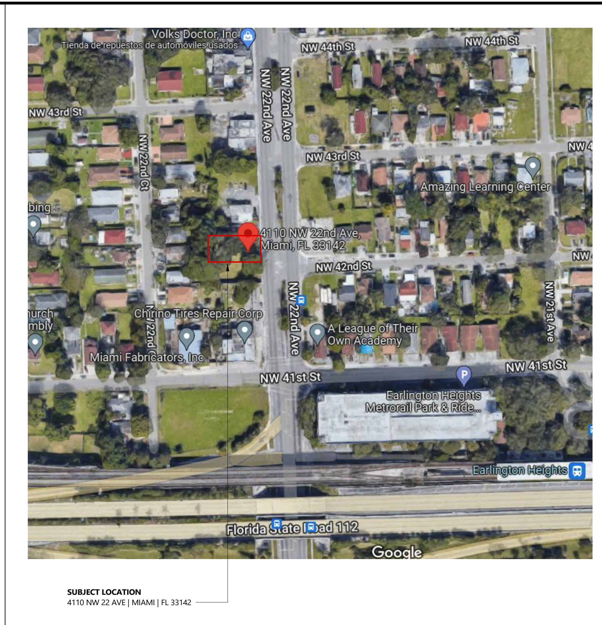
2 AERIAL VIEW N.T.S.