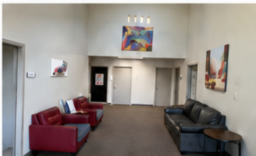
Common Area / Lobby