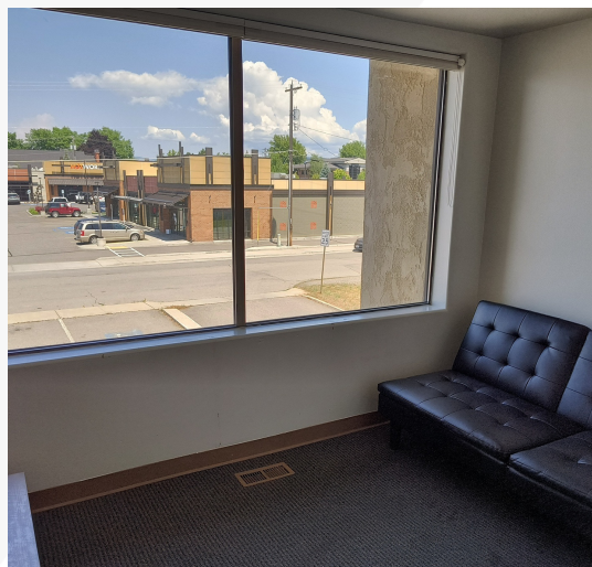
Extended Waiting Rm