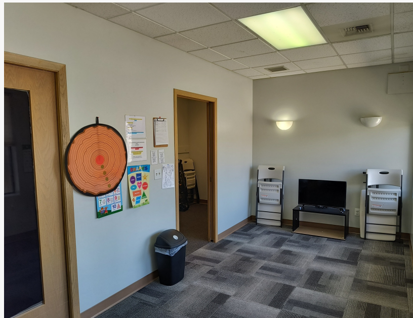
Treatment or Conference