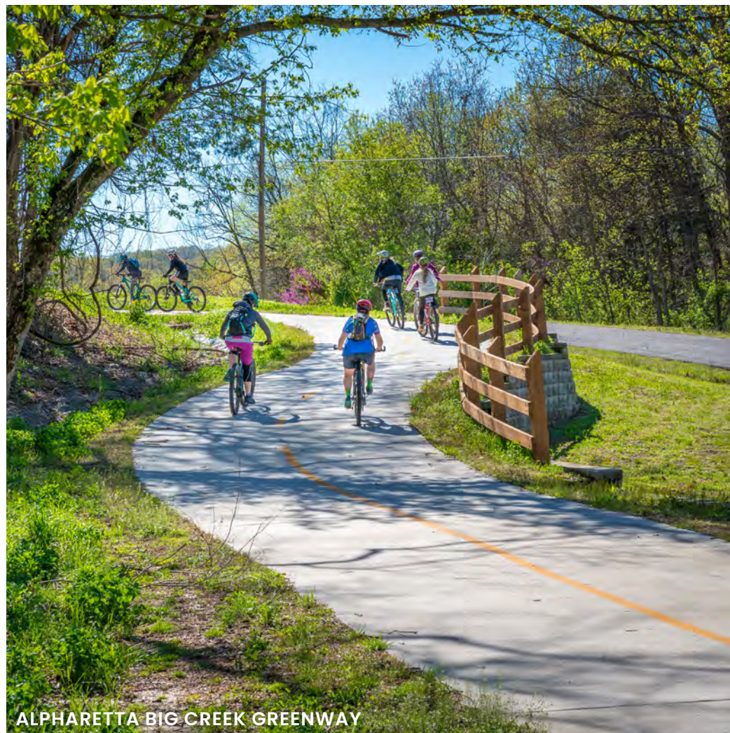
ALPHARETTA BIG CREEK GREENWAY