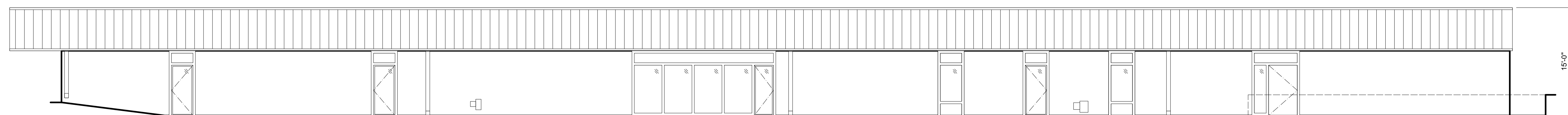
2 OVERALL EAST ELEVATION SCALE: 1/8" = 1'-0"