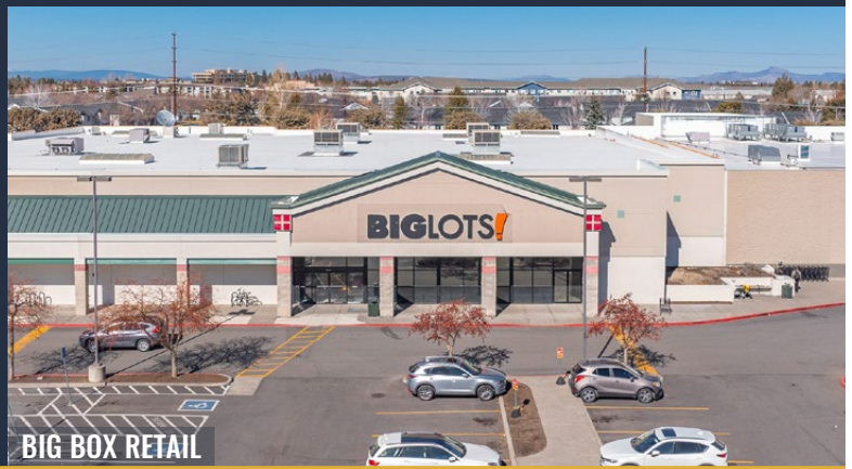
BIG BOX RETAIL