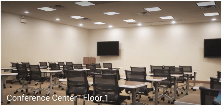
Conference Center | Floor 1