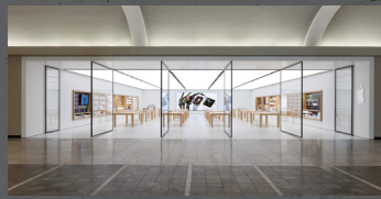
PENN SQUARE MALL