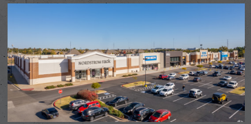
BELLE ISLE STATION