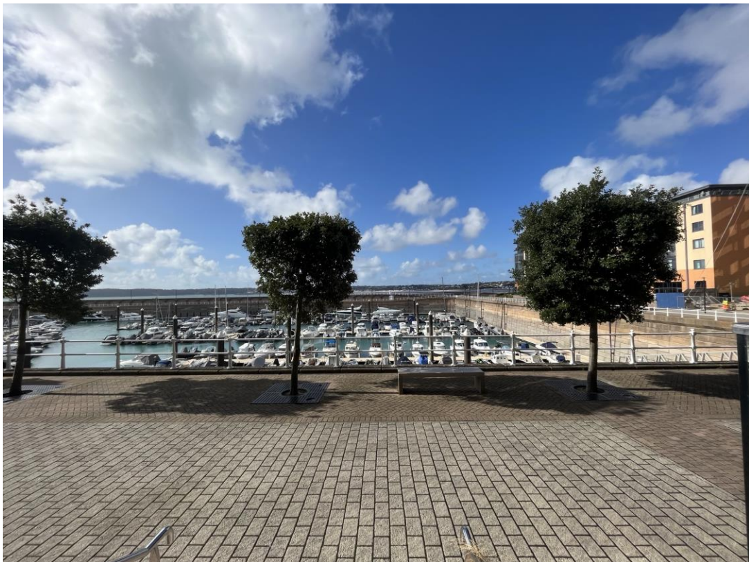
West Facing View

We attach a site plan and location plan for reference purposes.