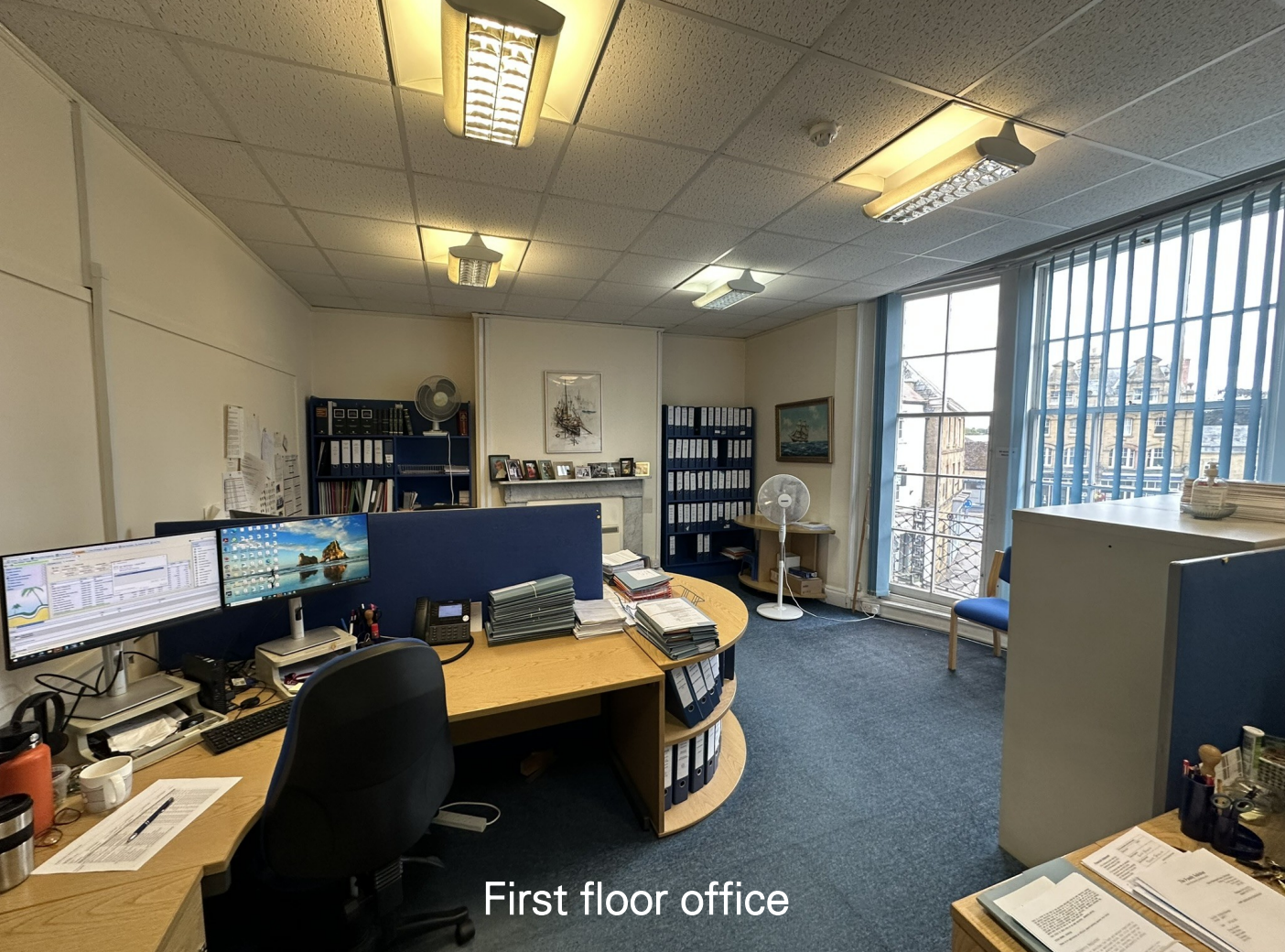
First floor office