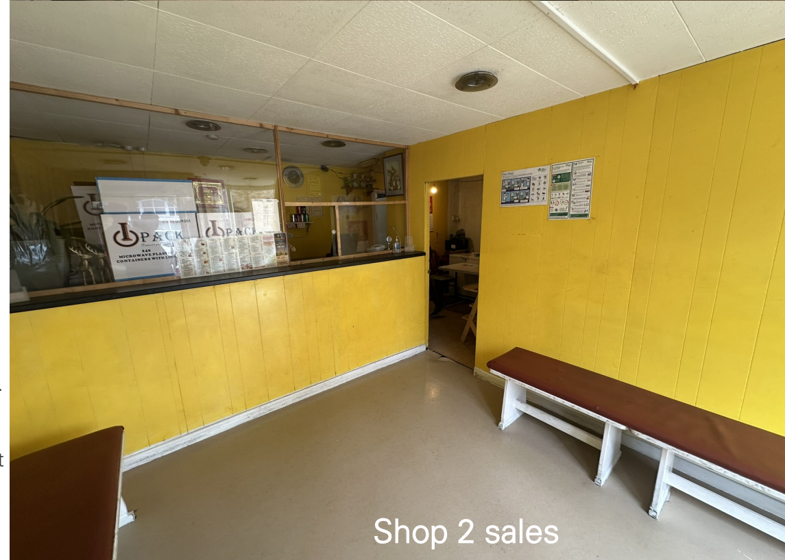
Shop 2 sales