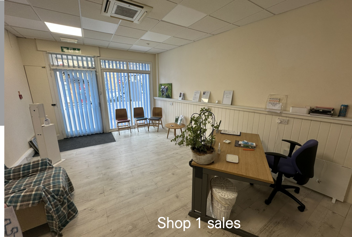
Shop 1 sales

To the rear of the building is parking for approximately 8 vehicles.