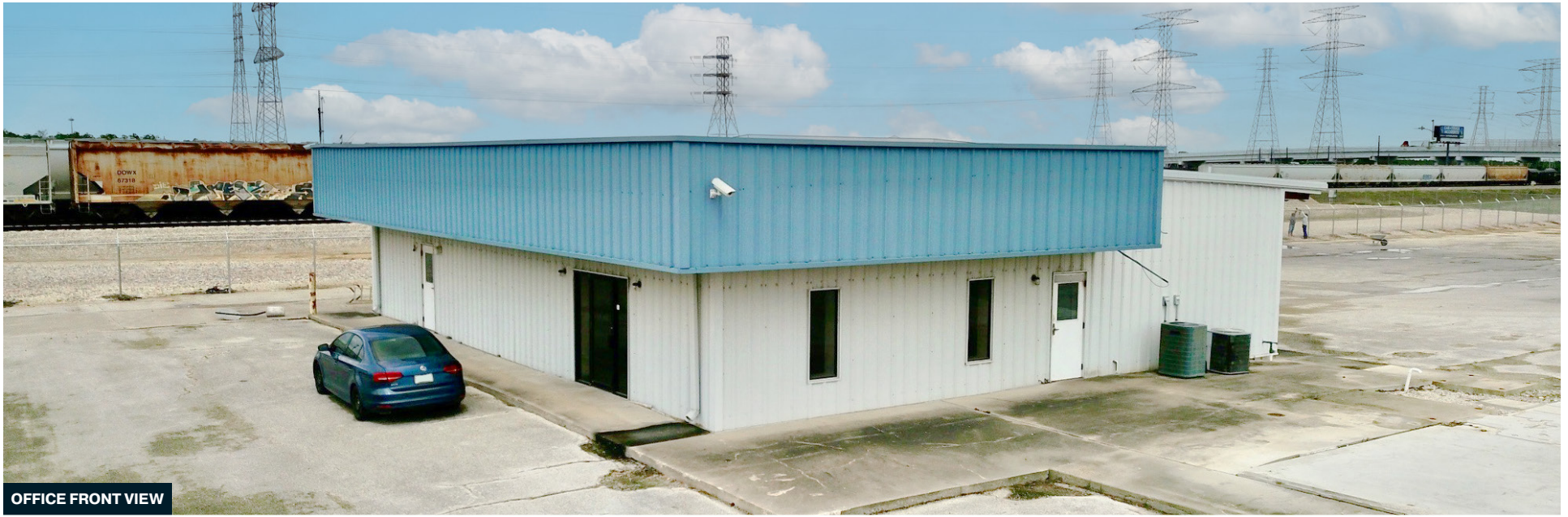
OFFICE FRONT VIEW