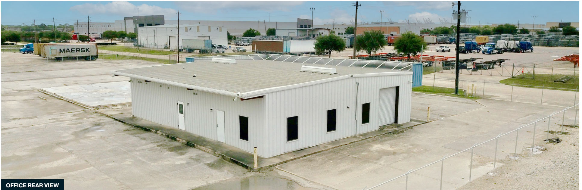
OFFICE REAR VIEW