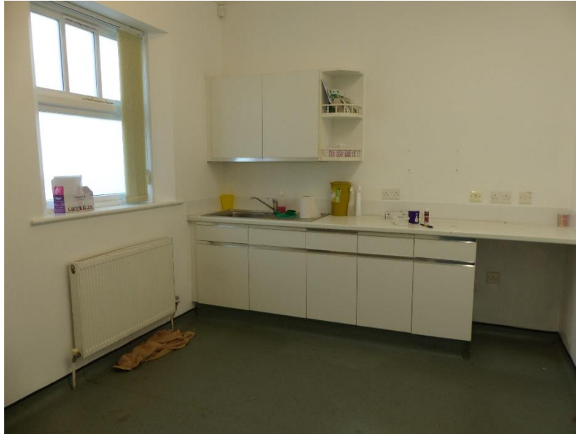
Former Consulting Room