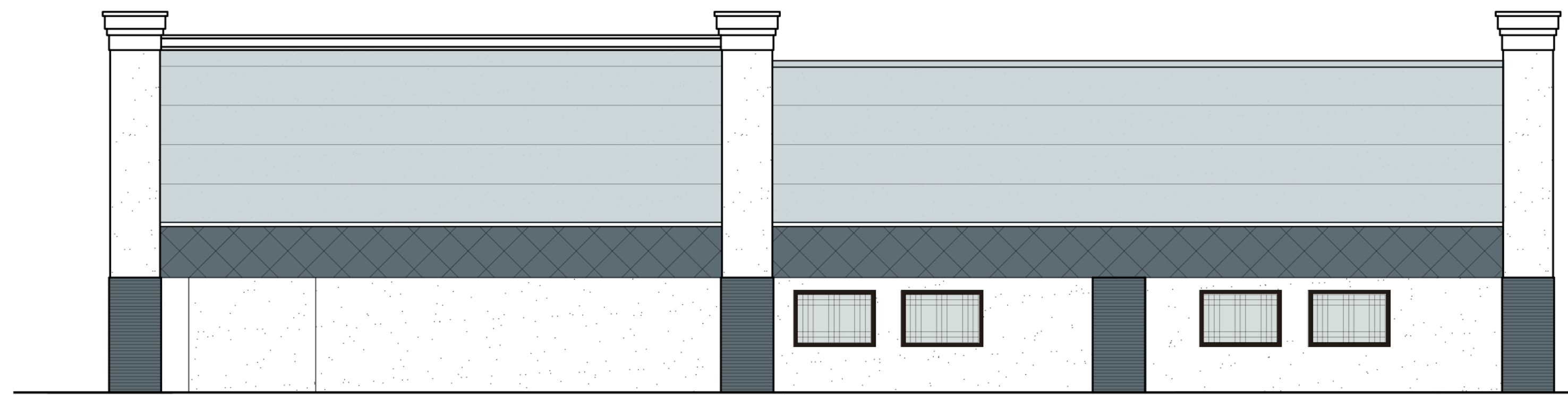
3 PROPOSED EAST ELEVATION A10 SCALE: 1/8" = 1'-0"