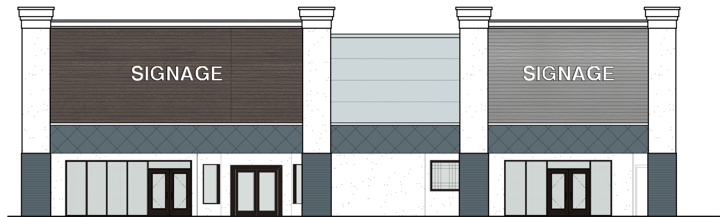
2 PROPOSED SOUTH ELEVATION A10 SCALE: 1/8" = 1'-0"