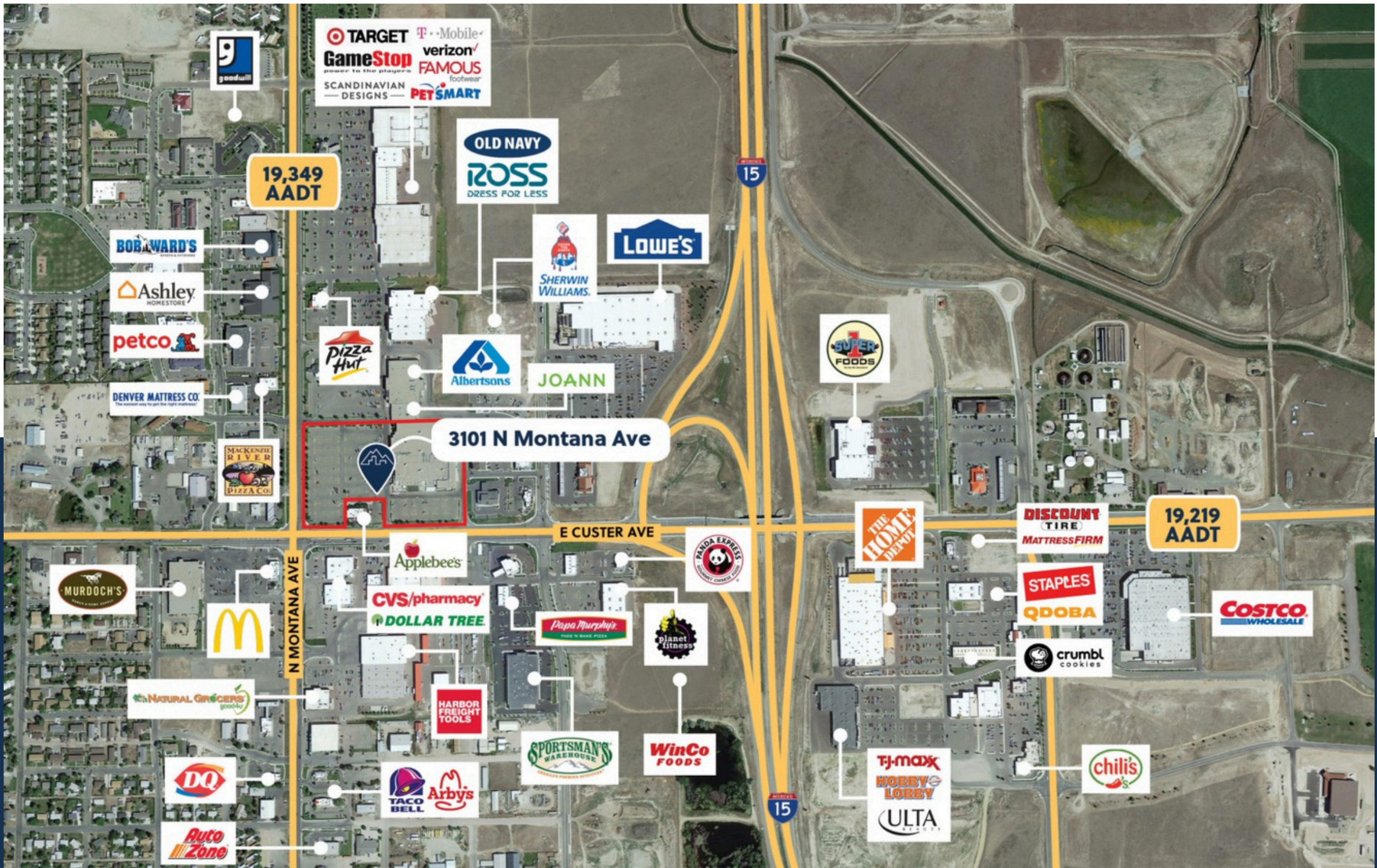
Local Retailer Map