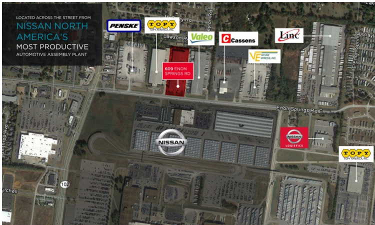
IMMEDIATE AREA — 609 HIGHLIGHTED | NISSAN GATE 6 DIRECTLY SOUTH