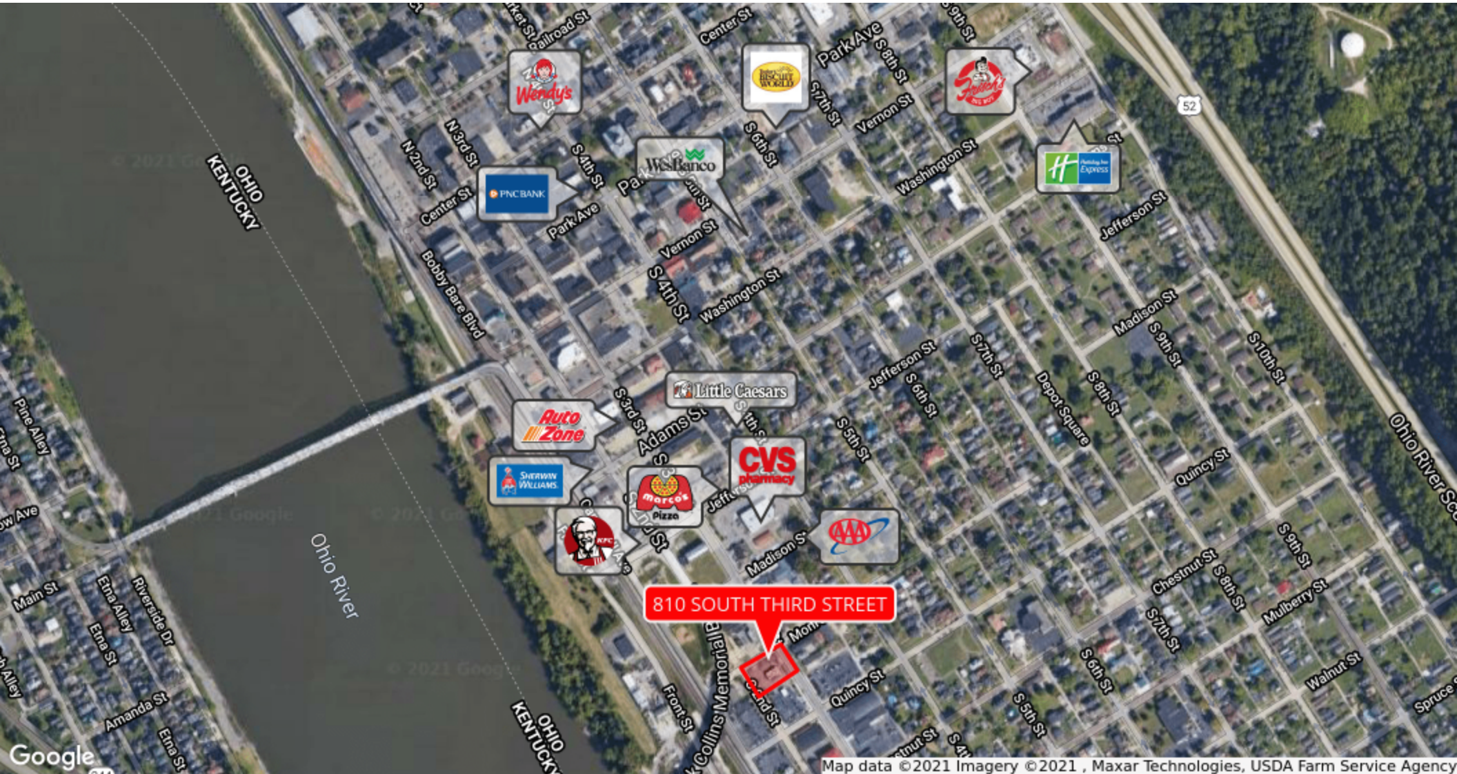
Map data ©2021 Imagery ©2021, Maxar Technologies, USDA Farm Service Agency