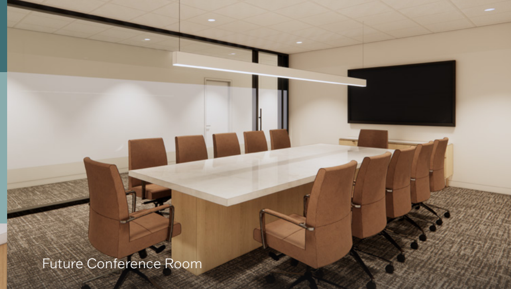
Future Conference Room