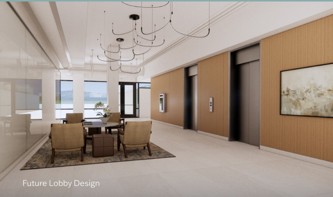
Future Lobby Design