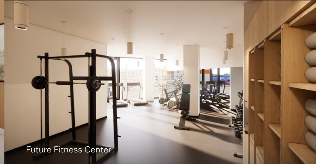
Future Fitness Center