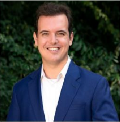
VICE PRESIDENT/AFFILIATE BROKER