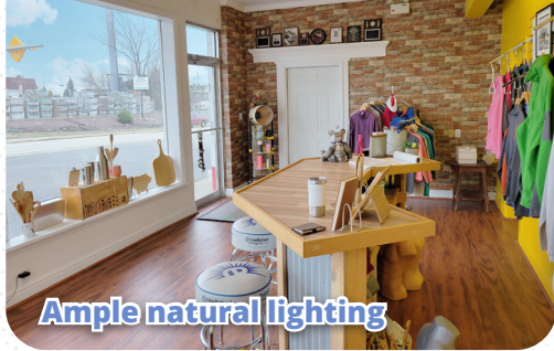
Ample natural lighting