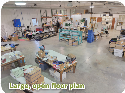
Large, open floor plan