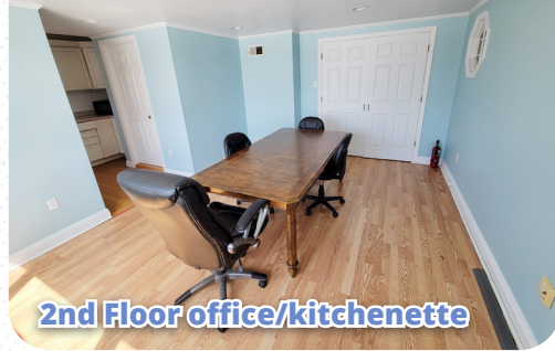
2nd Floor office/kitchenette