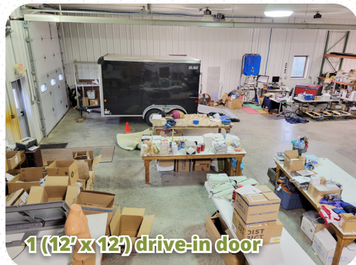
1 (12' x 12') drive-in door