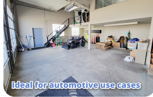
Ideal for automotive use cases