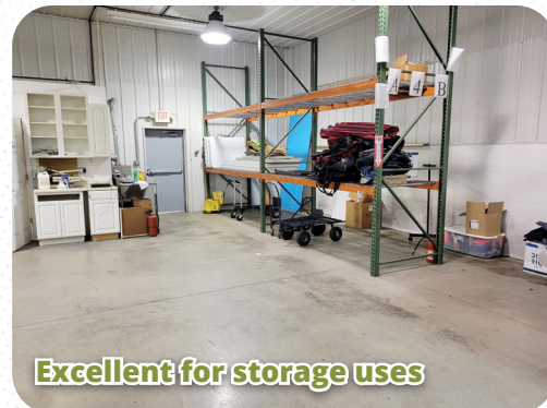
Excellent for storage uses