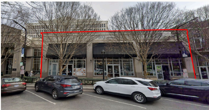
THE BUILDING — 17 S. MAIN STREET

A ±70 SF former ATM space directly on Main Street in downtown Greenville. Existing utility connections from the prior ATM remain in place, allowing a straightforward return to ATM use or conversion to another small-format retail concept. The property benefits from exceptional visibility and consistent foot traffic driven by a vibrant mix of local boutiques, national retailers, award-winning restaurants, and nearby destinations such as Falls Park on the Reedy.