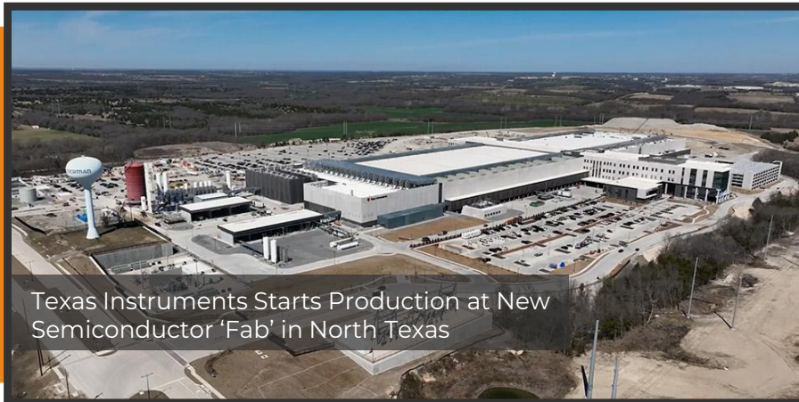
Texas Instruments Starts Production at New Semiconductor 'Fab' in North Texas