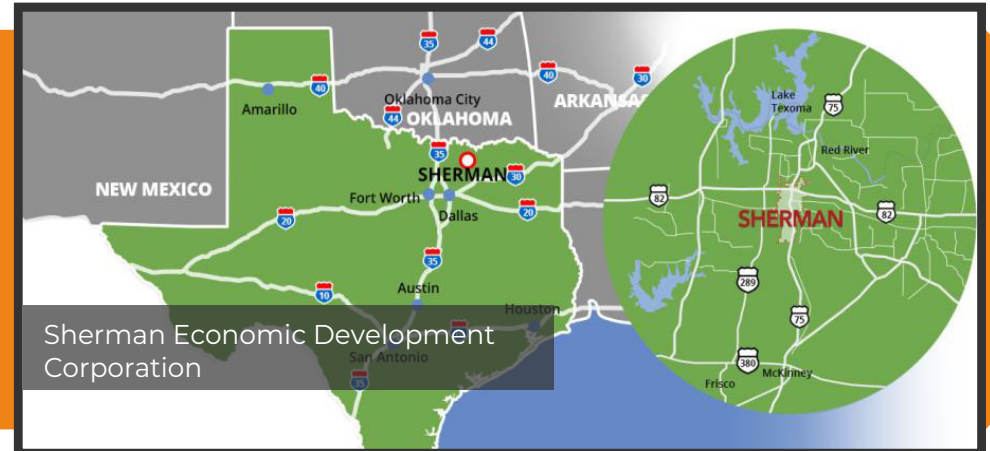
Sherman Economic Development Corporation