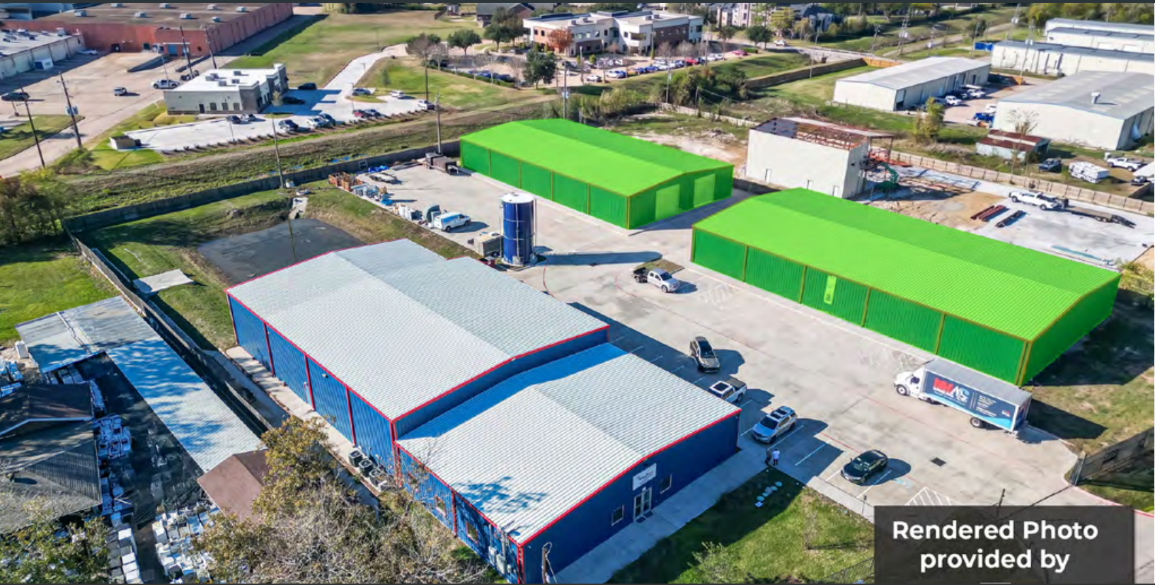
Rendered Photo provided by