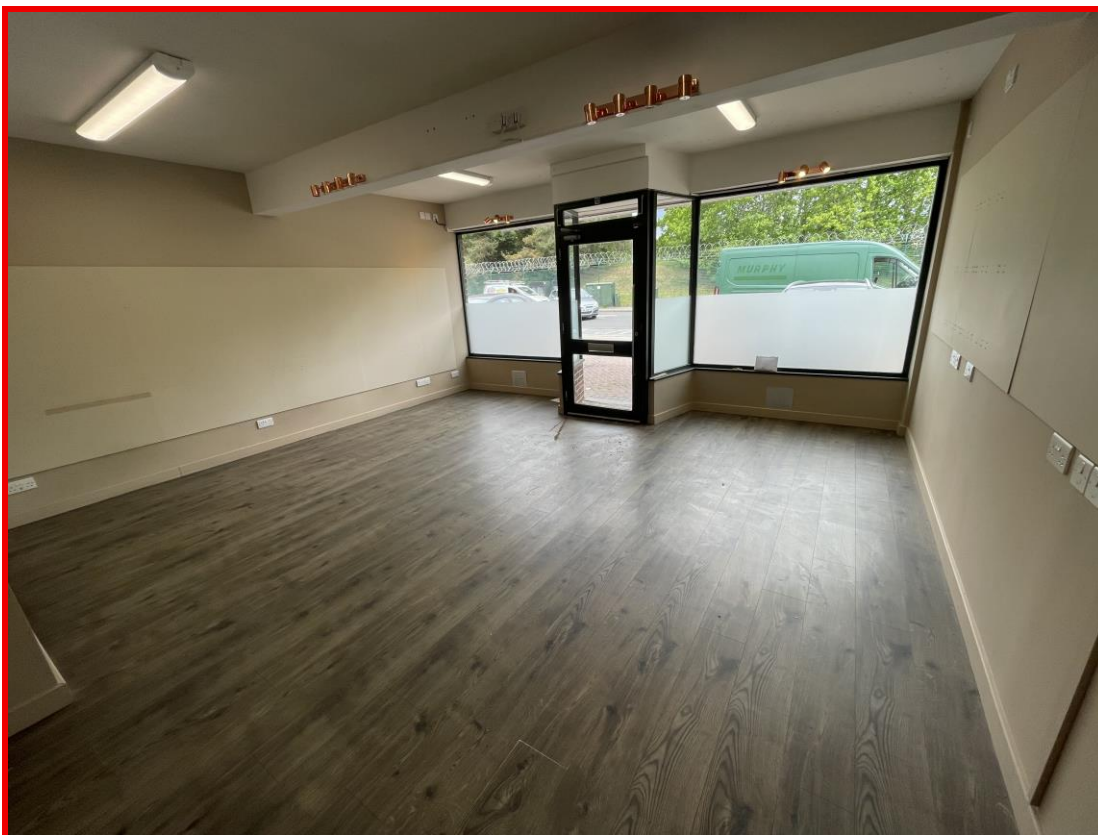
Picture showing retail area of 410

Two prominent lock-up shops of good size and width, set within a popular shopping parade located on the busy Yorktown Road. There is customer parking to the front of the shops.