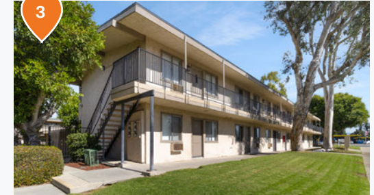
2330-2340 N. Grand Ave, Grand Apartments (Part of a 4-Property Sale), Santa Ana, CA