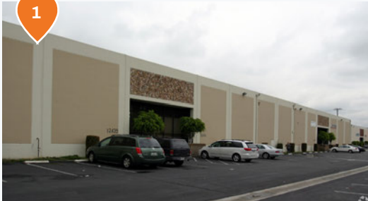
12349-12455 Florence Ave Santa Fe Springs, CA