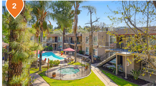
1440 Olivewood Lane, Alpine Terrace Apartments, Alpine, CA