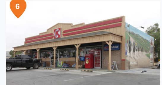
790 6th St, Circle K Norco, CA