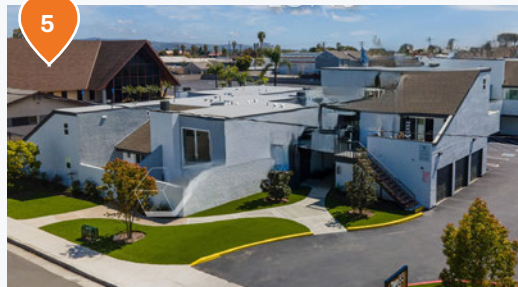
283 Avocado St, Loft Apartments, Costa Mesa, CA