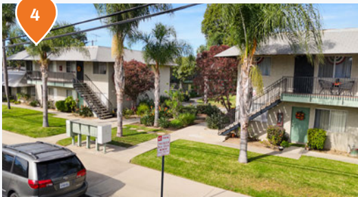
1220 E. Santa Clara Ave, Villa Clara Apartments (Part of a 4-Property Sale), Santa Ana, CA