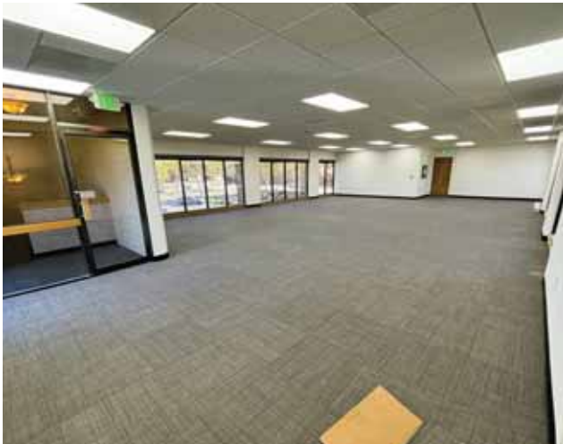
Second Floor - 6962 Almaden Expressway