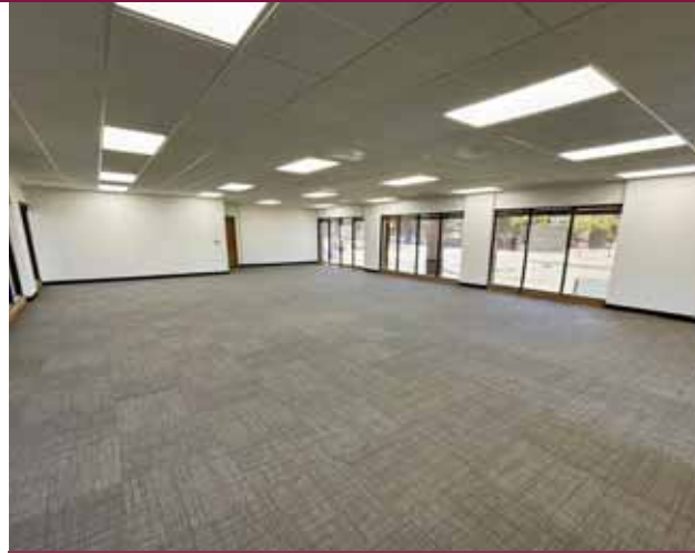
Second Floor - 6962 Almaden Expressway