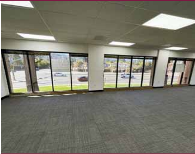
Second Floor - 6962 Almaden Expressway