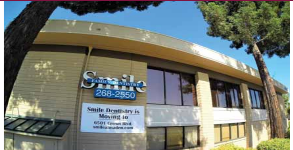
6962 Almaden Expressway - Second Floor