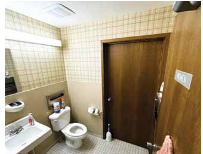
Second Floor - 6962 Almaden Expressway