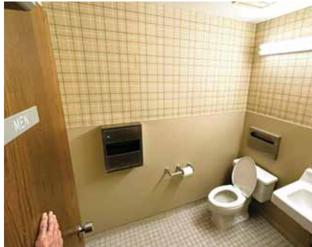
Second Floor - 6962 Almaden Expressway