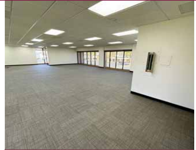
Second Floor - 6962 Almaden Expressway