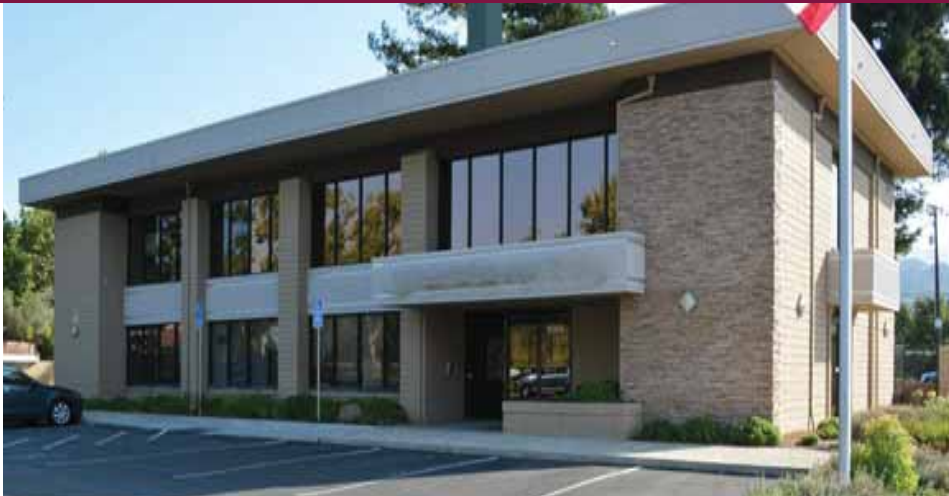
6964 Almaden Expressway - Ground Floor